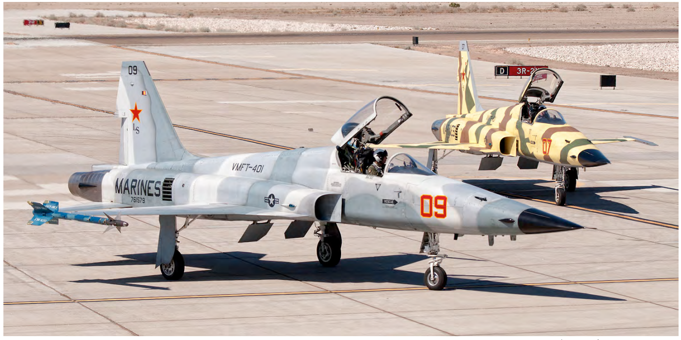
Yuma is of course the homebase of VMFT-401, an aggressor unit flying the F-5N in various awesome colour schemes.