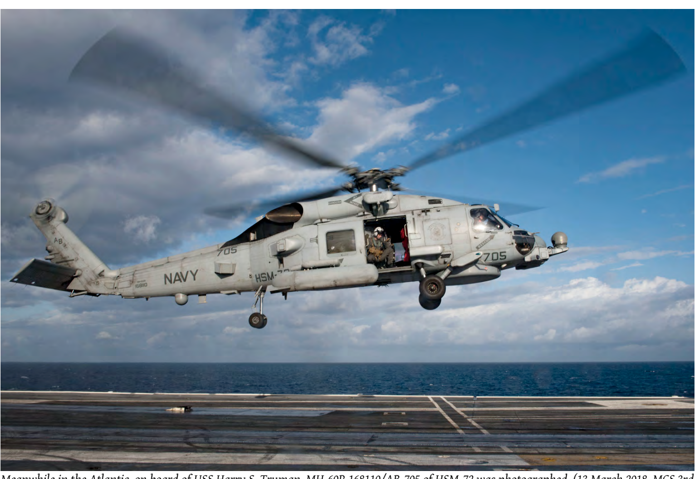
Meanwhile in the Atlantic, on board of USS Harry S. Truman, MH-60R 168110/AB-705 of HSM-72 was photographed.

are Columbus AFB (MS), Laughlin AFB (TX), Sheppard AFB (TX) and Vance AFB (OK). The new T-X trainer will provide student pilots with the skills and competencies required to transition into 4th and 5th generation fighter aircraft.