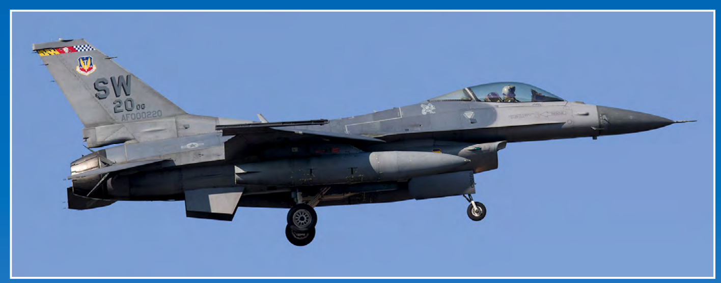
On their way from Bagram to Shaw, a contingent of SW F-16s visited Spangdahlem and flew local missions. (00-0220, 20th OG, 23 February 2018,)