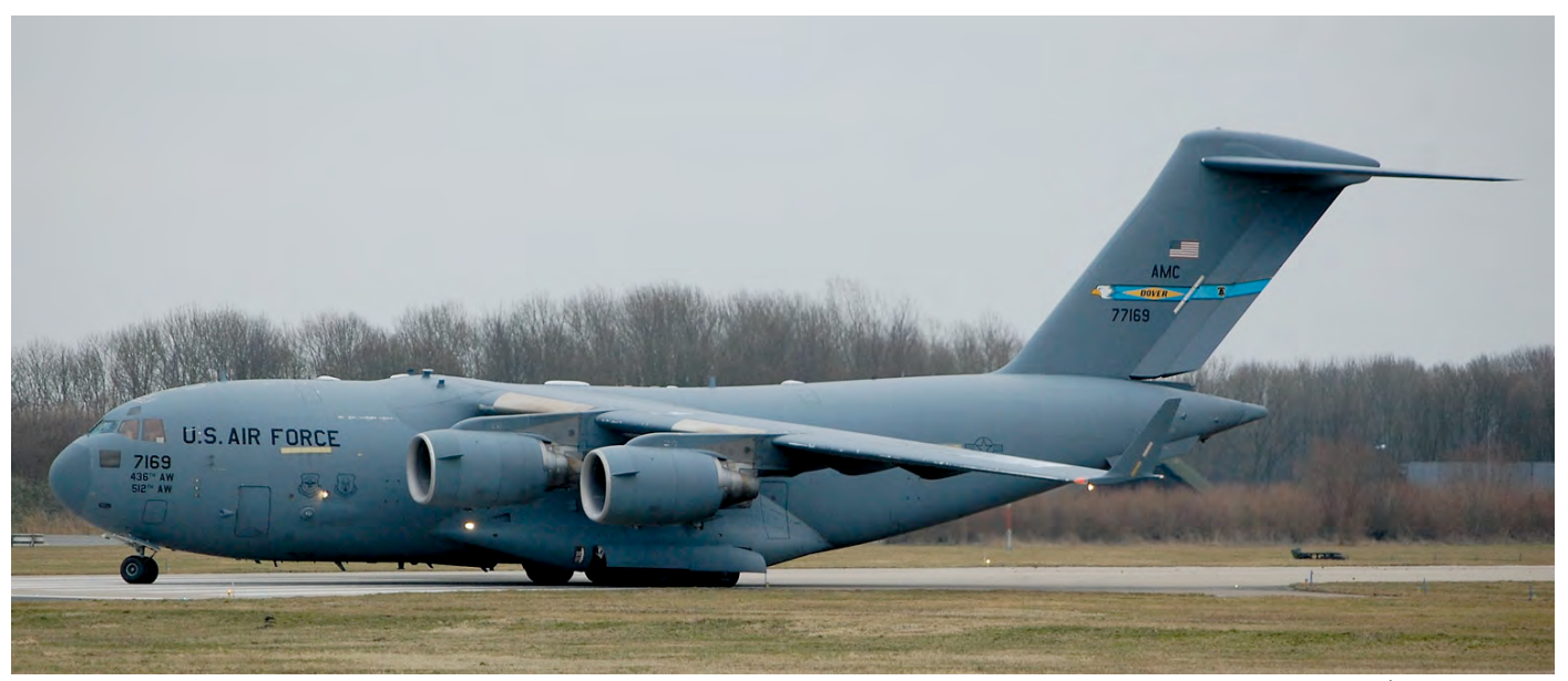
Many C-17As supported the deployment of the US ANG F-15s to Leeuwarden. Seen here is 07-7169 from Dover-based 3rd AS. (16 March 2018)