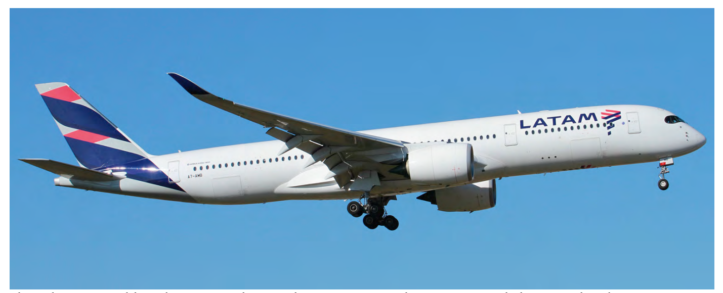
This Airbus A350 was delivered to LATAM Airlines Brasil as PR-XTF in November 2016. Four months later it was leased to Qatar Airways as A7-AMB but still in LATAM colours. In Europe it is mostly seen at Munich. (Brussels, 25 February 2018)