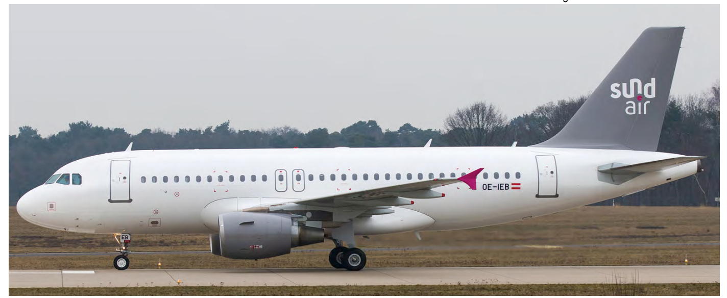
This Airbus A319 was delivered to Hamburg International Airlines in 2009 as D-AHIN. It operated a few months for Air Berlin before being leased by Syphax Airlines from March 2012 as TF-IEF. The Airbus was withdrawn from use in 2015 and destined for Germania. Registered as OE-IEB the Airbus arrived at Woensdrecht. Johan Havelaar caught the Bus after performing a test flight in the colours of Sund Air.