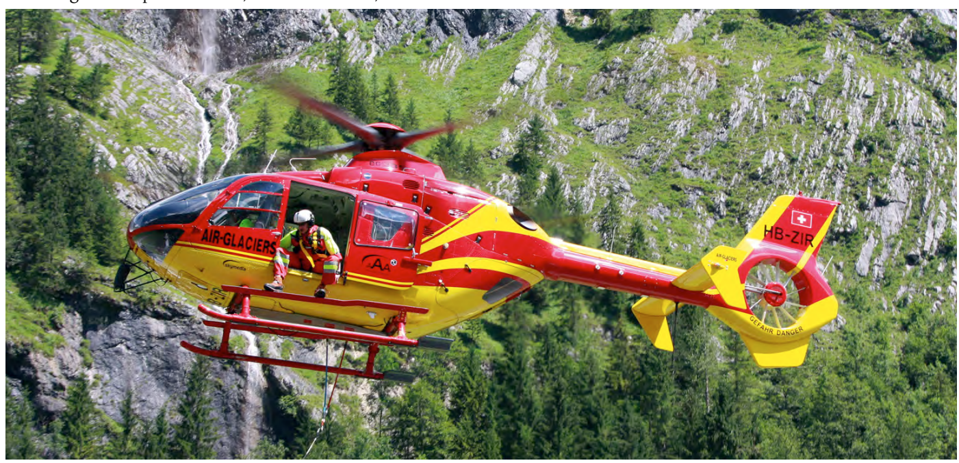
The medic sits casually inside the Air-Glaciers Eurocopter, assisting the pilot in manoeuvring into a tight forrest area. Sadly there was no help on 24 March 2018 when HB-ZIR crashed near St. Bernhard, Switzerland, in daylight and in reportedly reduced visibility and strong winds. It was one of two responding to recover people that may have become trapped by an avalanche. The crew of two was not injured. (Lauterbrunnen, 31 July 2014,)

the aircraft/gear at all. The airport authority reported the