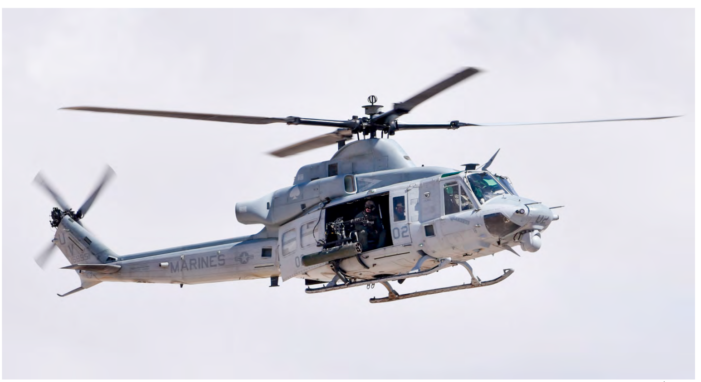
Not only a great place to visit to witness fighter operations, helicopters are an integral part of exercises held at Nellis AFB. UH-1Y 168951/UV-02 of HMLA-267 was seen in March. (14 March 2018,)

With the USAF's budget request for Fiscal Year 2019 in mind it is certainly feasible that the new OA-X can fit in there, or at least a part of the procurement. Further testing, experimentation and evaluation of the Wolverine and Super Tucano will be done during May to July 2018 at Davis-Monthan AFB (AZ).