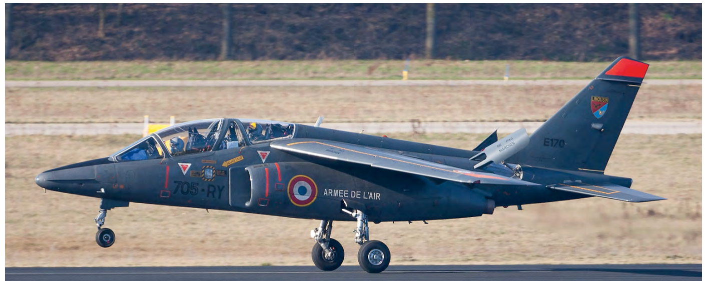
Seen here at Eindhoven is one of the Alpha Jets that visited the Netherlands recently. This particular one, E170/705-RY, is from EIV 03.004 'Limousin'.