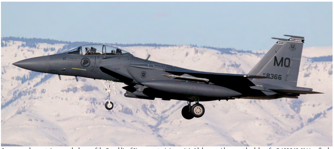
Snowcapped mountains near the home of the Republic of Singapore training unit in Idaho, provide a great backdrop for F-15SG 05-8366 on finals. (Mountain Home, 05 March 2018,)