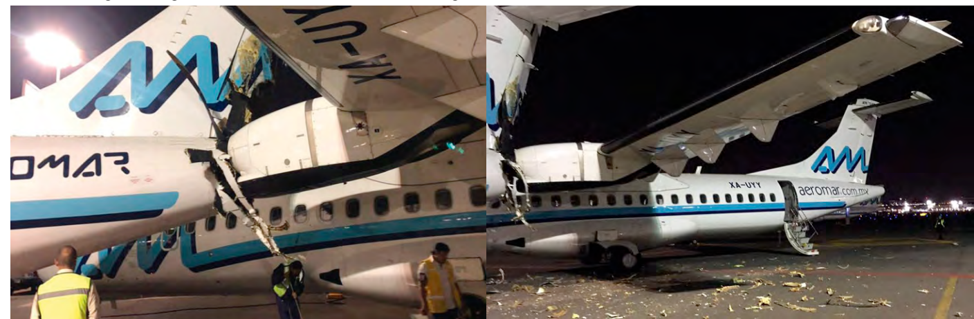
Aeromar Airlines can submit a big claim with its insurance company, after two of their ATRs collided with each other. ATR72 XA-UYY was engaged in an engine test run when the aircraft jumped the chocks and hit parked ATR42 XA-UAV. The carnage it created is seen on these two pictures, taken shortly after the incident on 29 March 2018.

<u>Credits</u>: ASN, Aviation Herald, B3A, JACDEC, FAA, Emol.com, Victor Chen