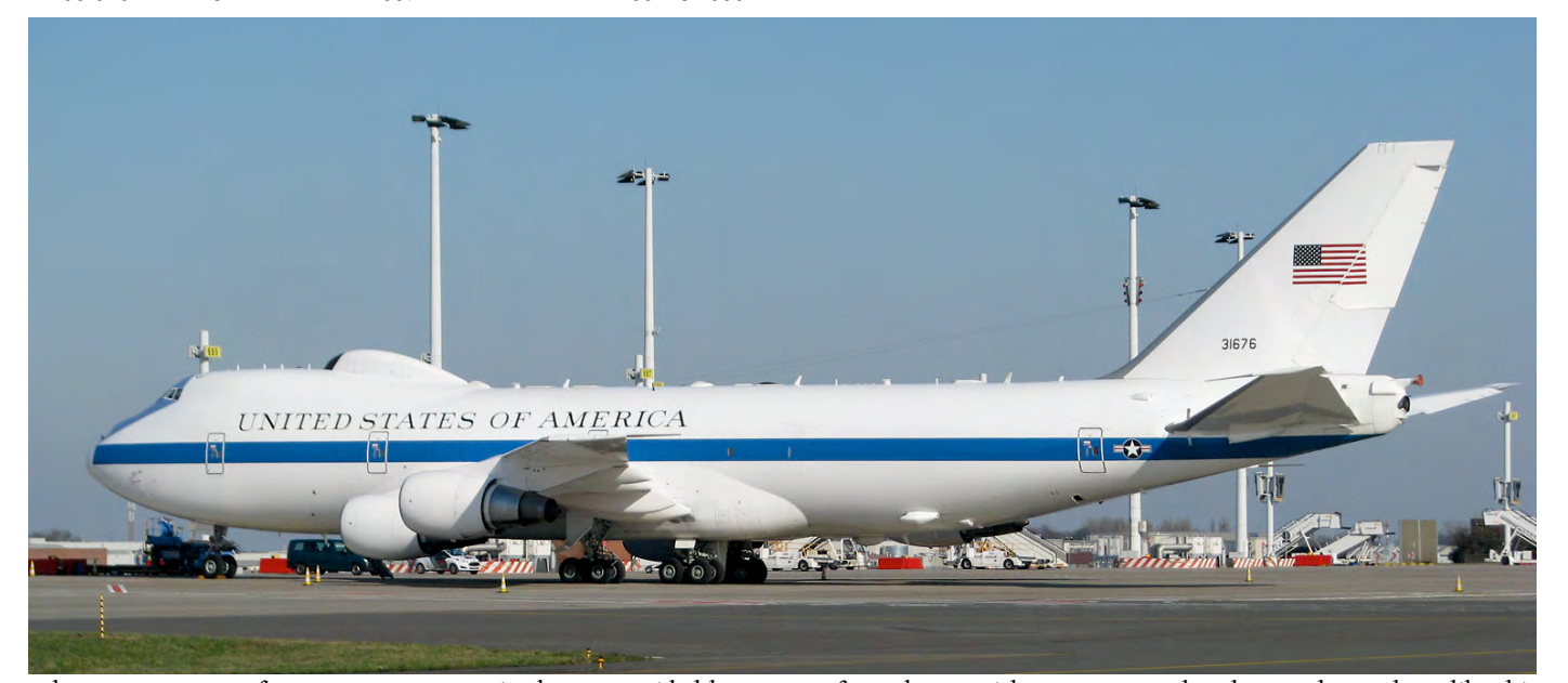
When POTUS comes from CONUS, support is always provided by an E-4B from the 1st Airborne Command and Control Squadron, like this 73-1676. (Brussels, 14 February 2018,)