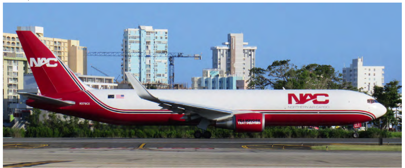
After 23 years of service with American Airlines this B767, ex N372AA, was withdrawn from use in 2015. After two years storage it was converted into a freighter at Tel Aviv in 2017. Northern Air Cargo took delivery of B767-323ERSF N379CX in February 2018. (San Juan (PR), 17 March 2018,)