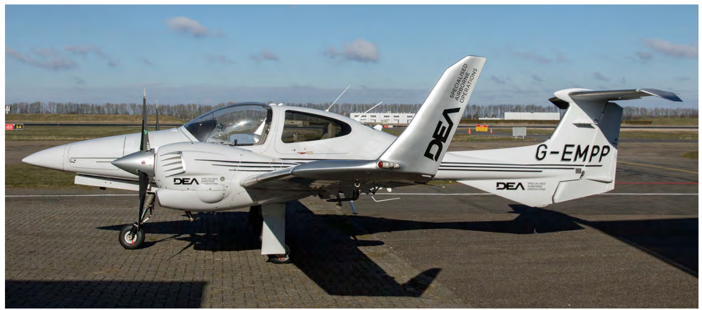
Diamond Executive Aviation acquired this Diamond DA42 in April 2012 and registered it as G-DSPY. In November 2015 the aircraft was transferred to G-EMPP, with DEA Aviation as the owner. The company carries out specialist charter work and the transport of small size dangerous goods. (Lelystad, 26 February 2018,)