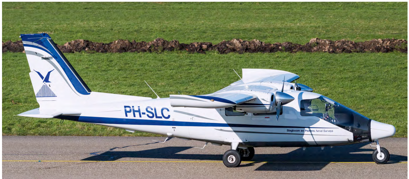
Vulcanair P-68 Observer 2 PH-SLC was delivered to Slagboom & Peeters on 22 November 2017. Former OY-ILS is the replacement for sold Cessna Vulcanair P-68 Observer 2 PH-SLC was activered to Singular State 13 10 PH-LAW. (Rotterdam - The Hague, 13 February 2018, Kees van Boven) VCG2A/R VQ-BZM G450 GainJet Aviatio