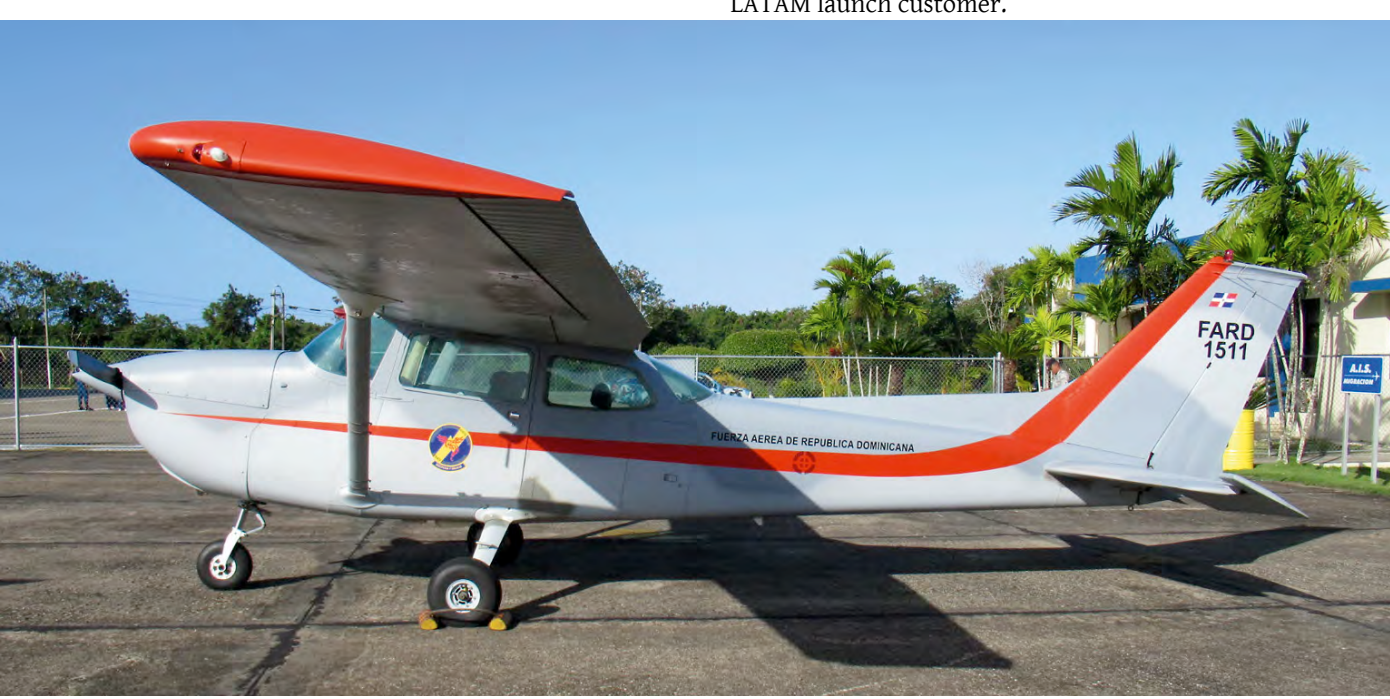
The days of the T-41D with the air force of the Dominican Republic are long gone. Late 2015, fice Cessna 172S were acquired for basic training duties with the Escuela de Aviacion. (FARD1511, Ce172S, Escuela de Aviacion, San Isidro, 11 February 2018, Johnny Rod)

In February, a member of the National Defence Committee of the House of Representatives revealed that talks with Hongdu Aviation Industry Corporation (HAIG) are still underway for at least eight L-15s. As always, it depends on financial and political green light. After all, such talks have stranded with Venezuela and Bolivia before, so Uruguay could be the LATAM launch customer.