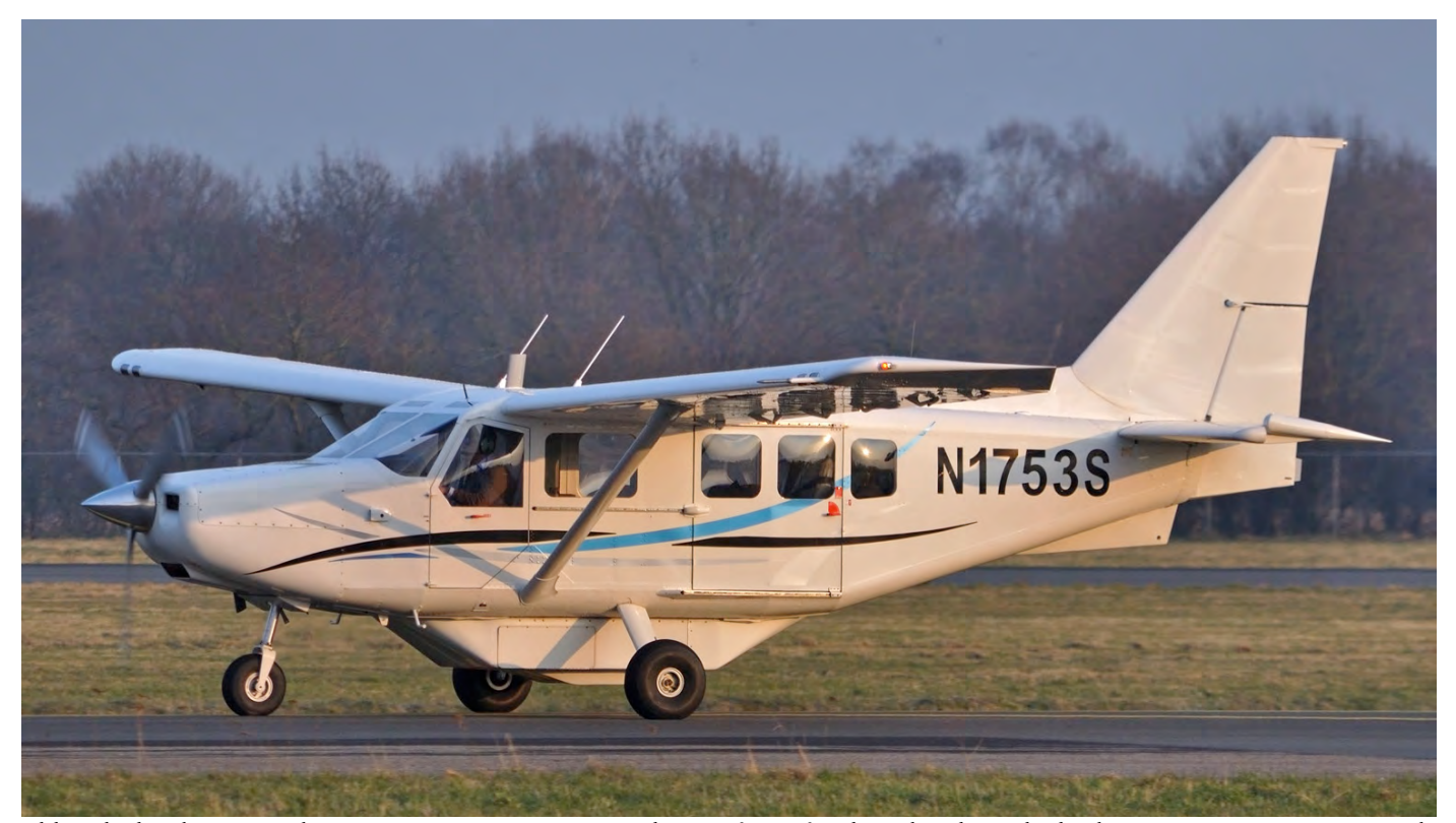
Although already registered to FSA Aviation in January 2017 the aicraft was first logged in the Netherlands in January 2018 at Seppe-Breda Airport. FSA Aviation is the parent company of Skyline Aviation. Gippsland GA-8-TC N1753S will most probably be a regular visitor at Eelde Airport. (Groningen-Eelde, 21 February 2018,)