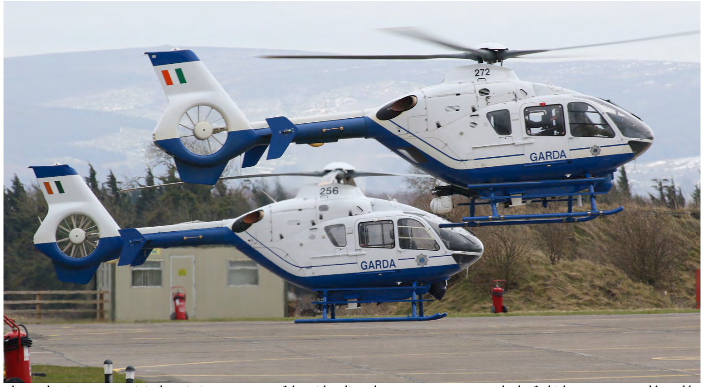
The Garda Air Support Unit is the aviation component of the Irish police. They operate two EC135Ts, both of which were seen at Baldonnel by Eric Van Rossum. (256 & 272 EC135T, GASU, 21 March 2018)

On 31 December 2016, the Corpo Forestale dello Stato ceased to exist, with its approximately 7.800 members being absorbed into the Carabinieri. The Corpo Forestale dello Stato P180 gained MM62304 and (as not confirmed) CC-1515 code;