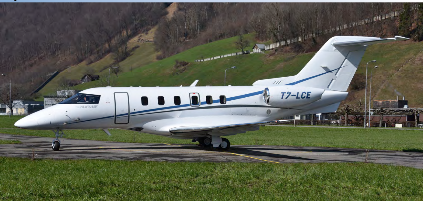
Since all test flights were successful and all certificates for delivery to customers were issued, the production of the PC-24 started and first examples are already delivered to different owners. This one is ready for delivery to an owner registered in San Marino, as it is registered as T7-LCE. (Stans-Buochs, 23 March 2018,)