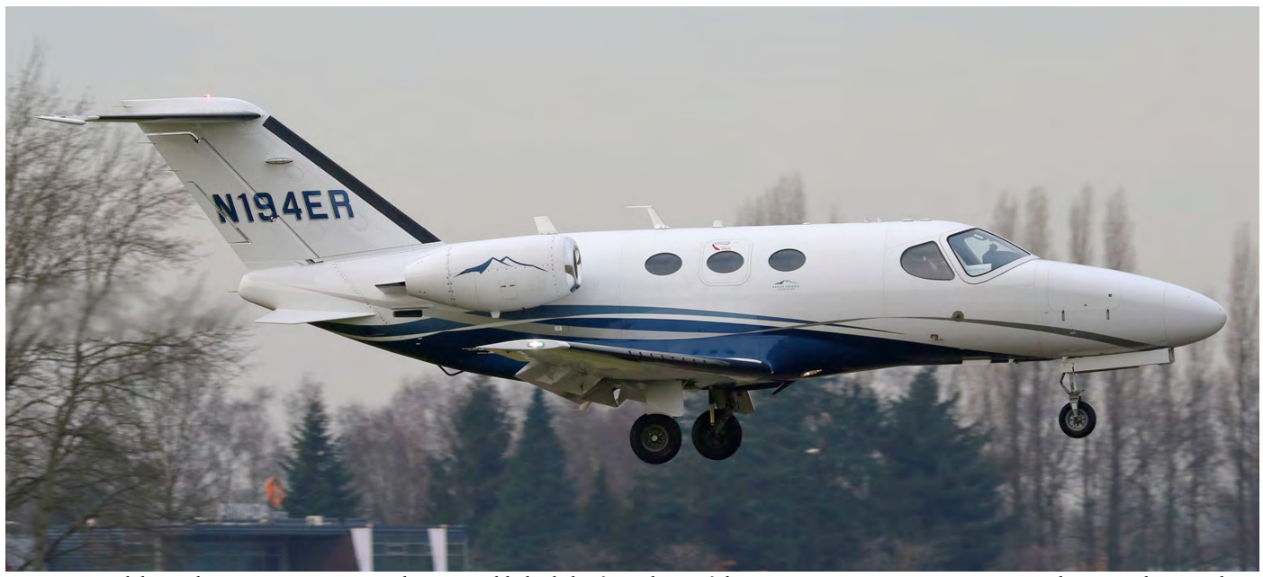
N194ER was delivered to Antwerp in 2013. When we published the first photo of this Mustang in issue 408, page 34, nothing was known about this bizjet. The aircraft is owned by Edito and based at Antwerp. Since approximately 2014 the Cessna is exclusively reserved for members of Blue Sky Aviation a fractional ownership club operated by Air Service Liège. (Budel, 17 February 2018,)