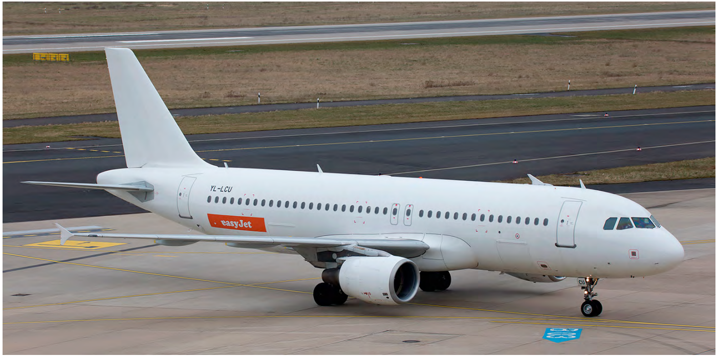
For extra capacity at Berlin-Tegel Airport, easyJet leases eight Smartlynx Airbus A320s. The aircraft are all white with a big orange sticker. YL-LCU is one of them and was digitalized at Dusseldorf on 23 March 2018.