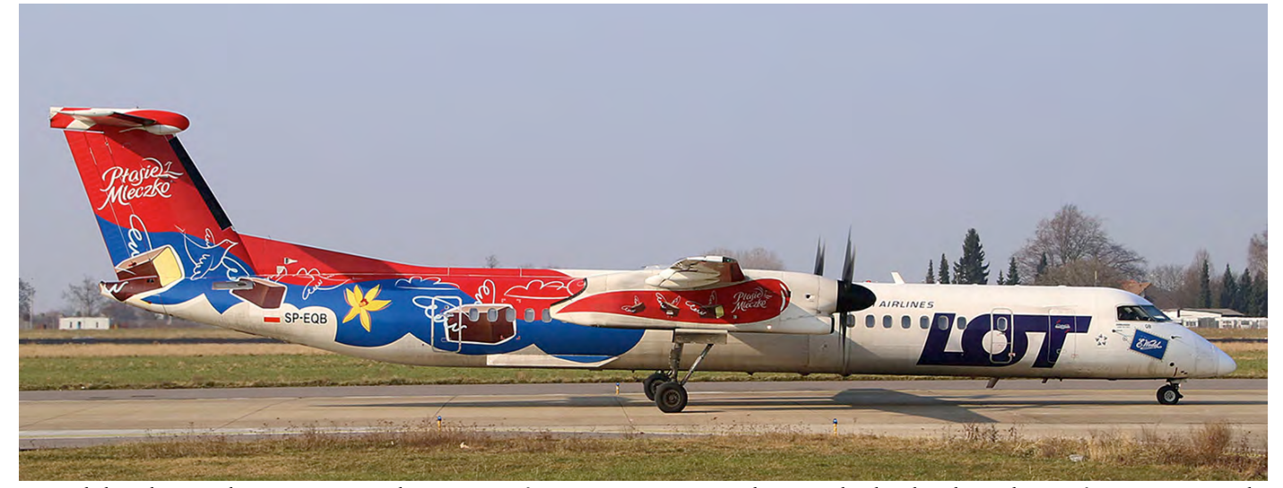
LOT Polish Airlines Dash 8 SP-EQB is seen here arriving for maintenance in special Ptasie Mleczko Chocolate colours. After maintenance the special colours will have been removed and just like sister ship SP-EQD it will have a white fuselage with the euroLOT logo. (Maastricht-Aachen, . 21 February 2018, Leo Remmel)