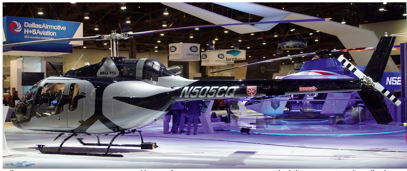
Bell 505 Jet Ranger X N505CQ is a very recent addition to the FAA registry. Since January 2018 this helicopter is registered to Bell Helicopters Textron. (Las Vegas (NV), 26 February 2018,)

Just a few days after revealing its rebrand to 'just' Bell, Bell Helicopter attended the Heli-Expo. The company introduced the new Bell 407GXi at the event with the first delivery scheduled this spring. Helisul Táxi Aéreo and Bell signed a purchase agreement of the first of four Bell 505 Jet Ranger X aircraft. All four Bell 505 aircraft will be delivered to Helisul Táxi Aéreo this year. The first law enforcement configured Bell 505 Jet Ranger X has been sold to the Sacramento Police Department. Scheduled for delivery this Spring the Bell 505 will be outfitted with several law enforcement provisions including high skid gear. Helite Aviation based at Montreal has ordered the first Bell 505 MAGnificent to be operated as a commercial, for hire aircraft. The helicopter will be customized by Mecaer at Bell Helicopter's Mirabel facility. Helicopters Incorporated signed to buy the first two 505s to perform electronic newsgathering (ENG) missions with the first