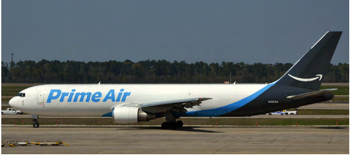
A year ago Prime Air, which is flying for Amazon in the USA, took delivery of B767 N1093A. The aircraft is operated by Atlas Air. N1093A was delivered in 1999 to Aeroflot as VP-BAZ moved in 2014 to Transaero Airlines as EI-RUV. In was also converted in 2017 at Tel Aviv. (Houston-George Bush Intercontinental (TX), 14 March 2018) Personal copy

Distribution to a third party is not allowed