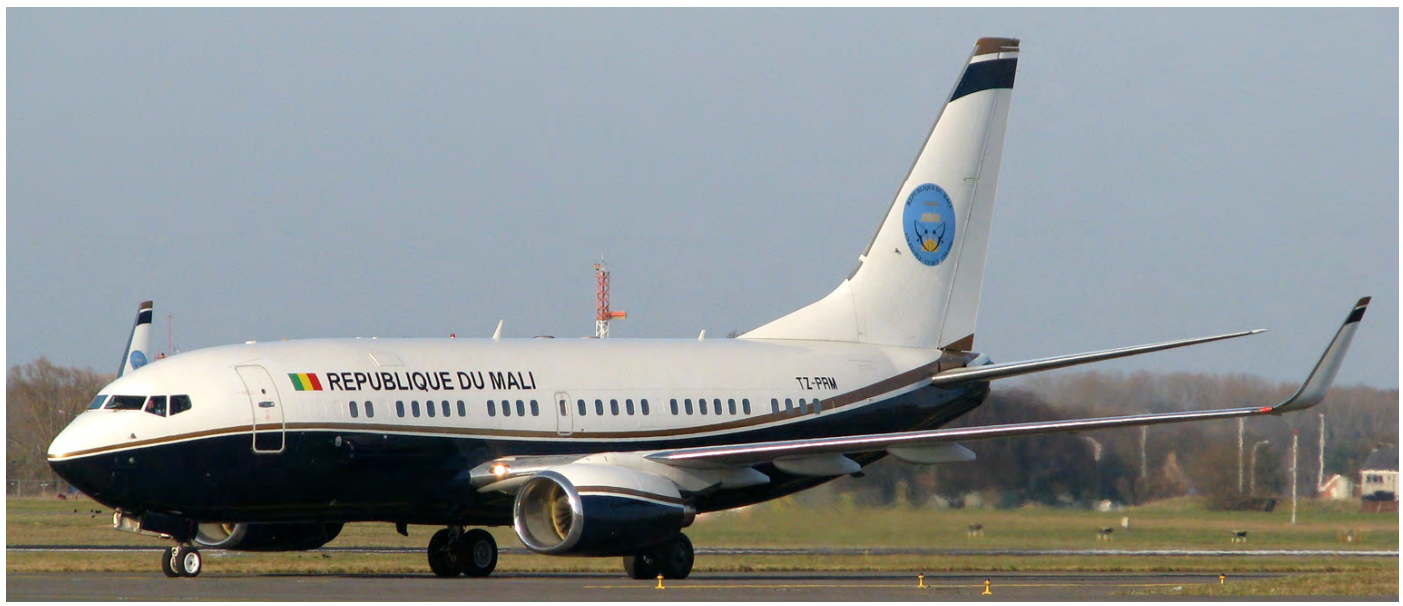
Delivered to NetJets in December 2000 this Boeing 737 was acquired by Bausch & Lomb in November 2001 as N164RJ. Jetmagic started to operate the BBJ1 for the Mali Government in March 2014 registered as P4-PRM. In April 2015 the aircraft was acquired by the Government of Mali and registered as TZ-PRM. It is however being operated by Jetmagic. (Brussels, 22 February 2018,)