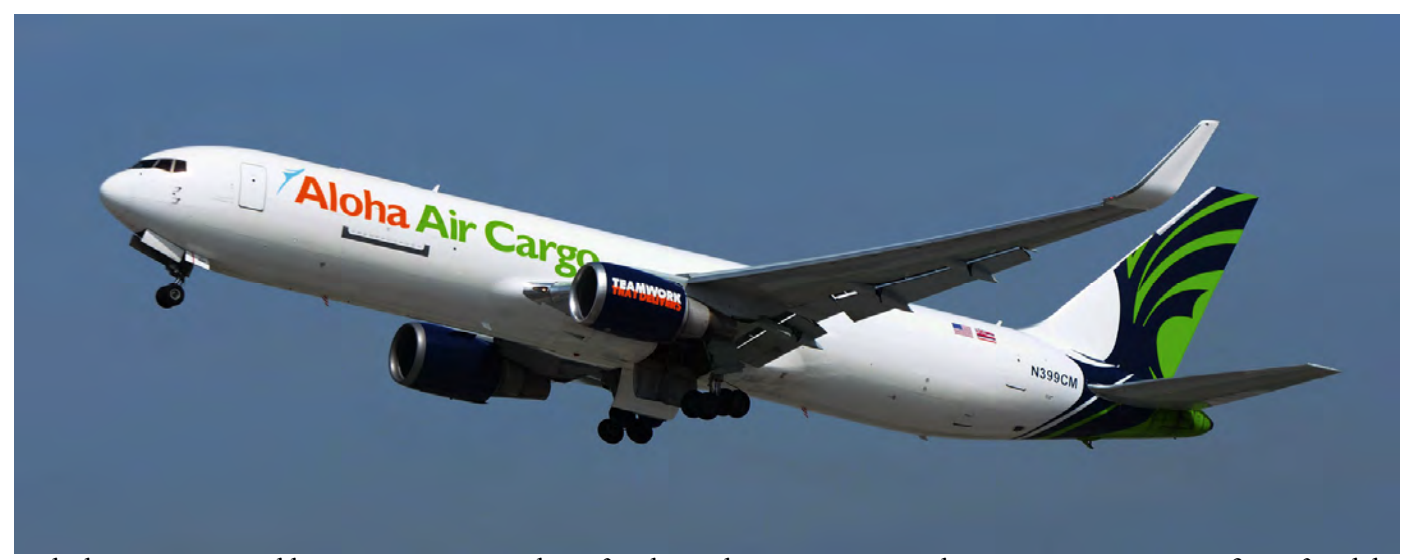
In the last years many older B767s are converted into freighter. This ex American Airlines B767 N382AN is now flying for Aloha Air Cargo as N399CM and delivered in November 2017. The conversion was done at Tel Aviv. (Los Angeles (CA), 9 March 2018,)