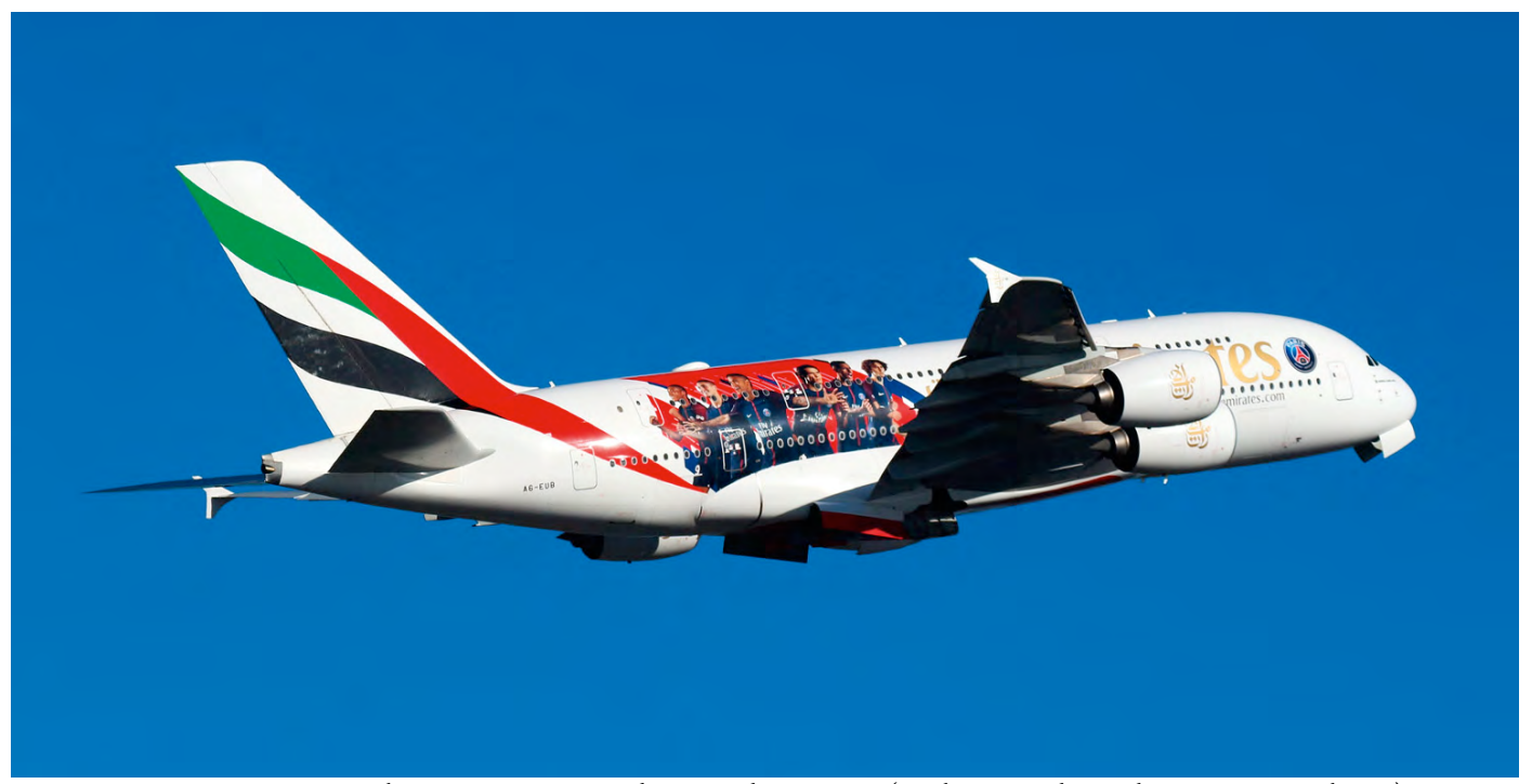
Emirates' A380 A6-EUB was painted in Paris St. Germain colours in February 2018. (London-Gatwick, 17 February 2018, David Long)

Captured by surprise Textron revealed a programme update on their Cessna Skycourier mid-March. The programme has been in full swing since it launched November 2017 and the prototype is already in the wind tunnel for aerodynamic testing and evaluation. The first flight of the twin engine turbo prop, deemed to complete the success of the Ce208 series and compete with the Viking/DHC-6-400, has been set to Q2 2019 and an entry into service in 2020. Two versions are developed, the passenger version for nineteen passengers and a freight version carrying three LD3 containers transporting six tons of payload over 900 nautical miles.