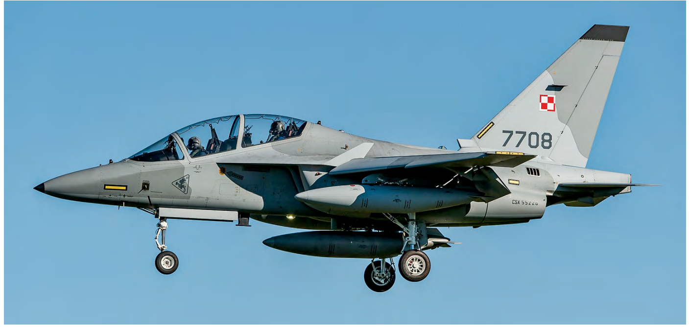
Poland just ordered an additional number of M346s. Seen here is the eighth and last example of the first order, which has been delivered to Deblin in the meantime. (7798, M346, Venegono, 23 October 2017, Marco Muntz)

On 23 August 2017 Kazan Helicopters announced the start of assembly of the first prototype of the Mi-38T, the military version of the Mi-38. They will build to prototypes and deliver before end of 2019, but expected end of 2018. Both prototypes will conducting joint flight test for compliance with the requirements of the Russian Armed Forces. According results of the tests, further purchases of the Mi-38T will be planned within the framework of the state armament program in 2018-2025. The Mi-38 can transport 30 passengers or 6000 kg internal cargo. The external load is 7000 kg. For comparison a Mi-17-1A2 can transport 24 troops or 4000 kg internal cargo and the Mil-26 90 troops or 20.000 kg. The Mi-38T has features like fuel system with explosion protection, special communications equipment and additional fuel tanks to increase flight range. The expected use will be combat search-and-rescue, VIP and troop transport.