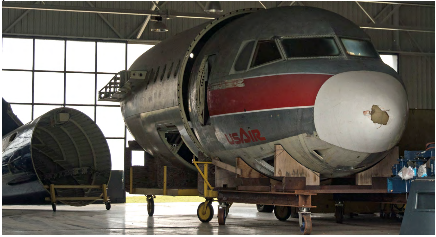
Rekkof, the name of Dutch aircraft manufacturer Fokker spelt backwards, has a presence at Lelystad Airport. Since Fokker went bankrupt they had storage space at the airport and recently they have started to empty them, like some sort of spring cleaning. Among others they found some Fokker parts; this cockpit section of a Fokker 100 (destined at one time for USAir), a dark blue Fokker 100 tail section plus the aft part of a Fokker 100 fuselage, where the engines can ben attached. Richard Poeser was present during the clean-up and took this picture of the hangar on 19 February 2018.

<u>Credits</u>: Aad van der Voet, Ruud Leeuw, Michael Prophet, Ralph Petterson (Conniesurvivors), propliner communities, and online photo websites.