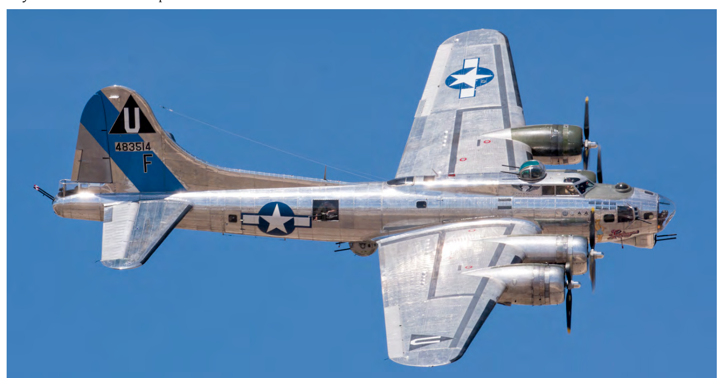
American air shows always feature a fair amount of warbirds. Immaculate B-17G 44-83514 ended its career as a DB-17G in 1959. (Luke, 18 March 2018,)