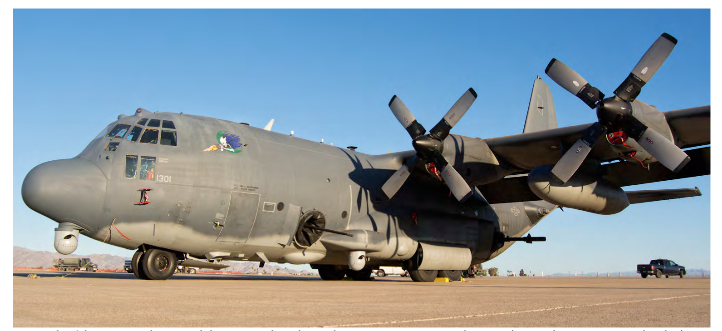
Fine study of the AC-130W that graced the static at the Luke air show. 98-1308 is a converted C-130H. (18 March 2018, Björn van der Flier)

165006/09. 164148/20. 164148/23 AV-8B of VMA-311 coded WL-xx: 164553/00, 165566/01, 164566/01, 165573/02, 16556711 165382/12, 165583/14, 164143/20, 164128/21, 164142/22 F-35B of VMA-211, coded CF-xx: