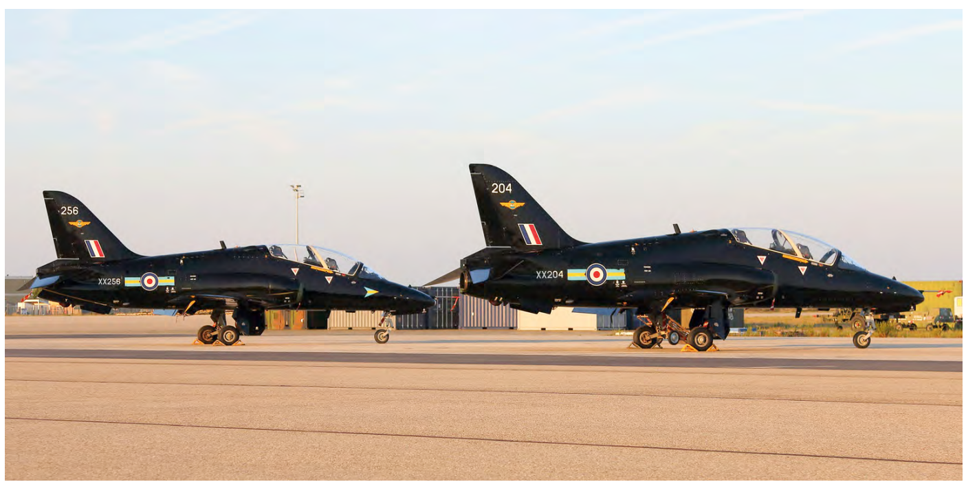
Hawk T1A of the Red Arrows crashed on 20 March as it was travelling from RAF Valley on Anglesey to RAF Scampton in Lincolnshire after completing simulator training. A bird strike is the suspected cause, although the Royal Air Force is still investigating the crash. In the picture, taken at a base in the south of France when these two Hawks were en route to Malta late September 2014 by Swingwing, XX204 (and XX256) is still adourned in the standard black Hawk colour scheme instead of the Red Arrows one, as it was part of 208(R)sq at the time.

number three tyre (inboard right hand) had completely gone, tyre number four (outboard right hand) was good. The aircraft repositioned for a landing on runway 26L, tower advised that a ground observer reported the left main gear was also affected besides the right main gear. The CRJ landed safely back on runway 26L about 1:45 hours after the decision to return and became disabled on the runway. Emergency services observed another large piece was lost from the left main gear during roll out resulting in sparks and fire during the roll out. The aircraft sustained substantial damage to the underside of the left hand wing.