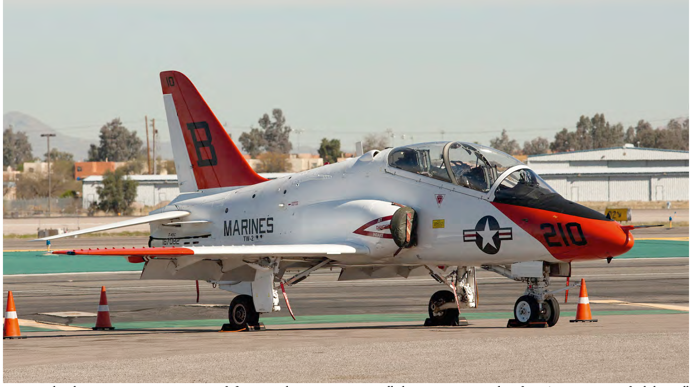
Every weekend, many US Navy trainer aircraft fly across the continent on so called navigation trips. Therefore it's no surprise to find these all around, also at smaller airports. This T-45C 167082 with its new code B-210 was found between some civilian aircraft at Tucson Intl, AZ on 18 March.

Three unknowns remain: Firstly, what is the timeline for the USAF's eventual procurement? Secondly, how many aircraft will the USAF eventually plan to procure? And lastly, what will the USAF give up in terms of aircraft that will retire?