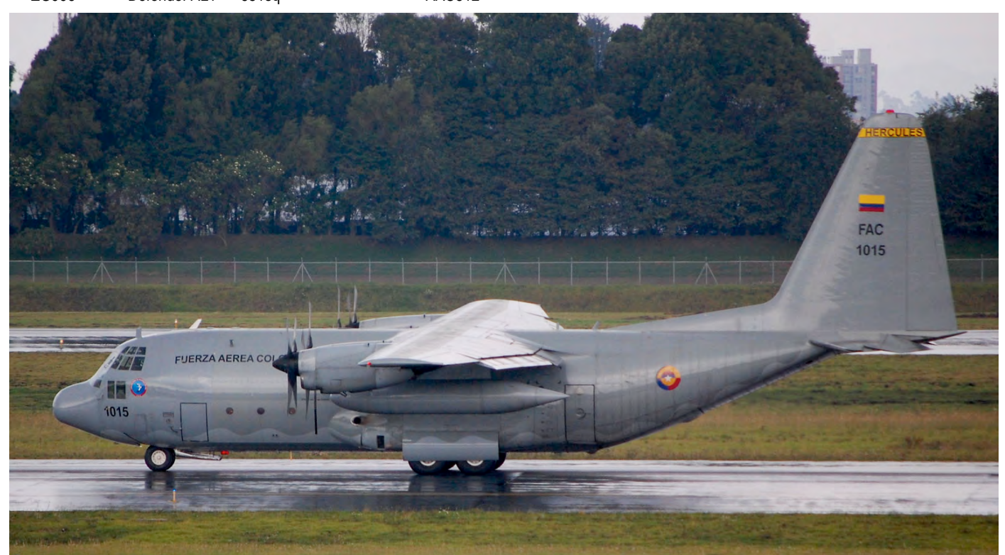
Colombia operates a single former Italian C-130H-1, and this is it, FAC1015. Seen taxiing at its homebase Bogota-El Dorado International in less than favourable weather conditions. (22 February 2018, Geurt van den Berg)