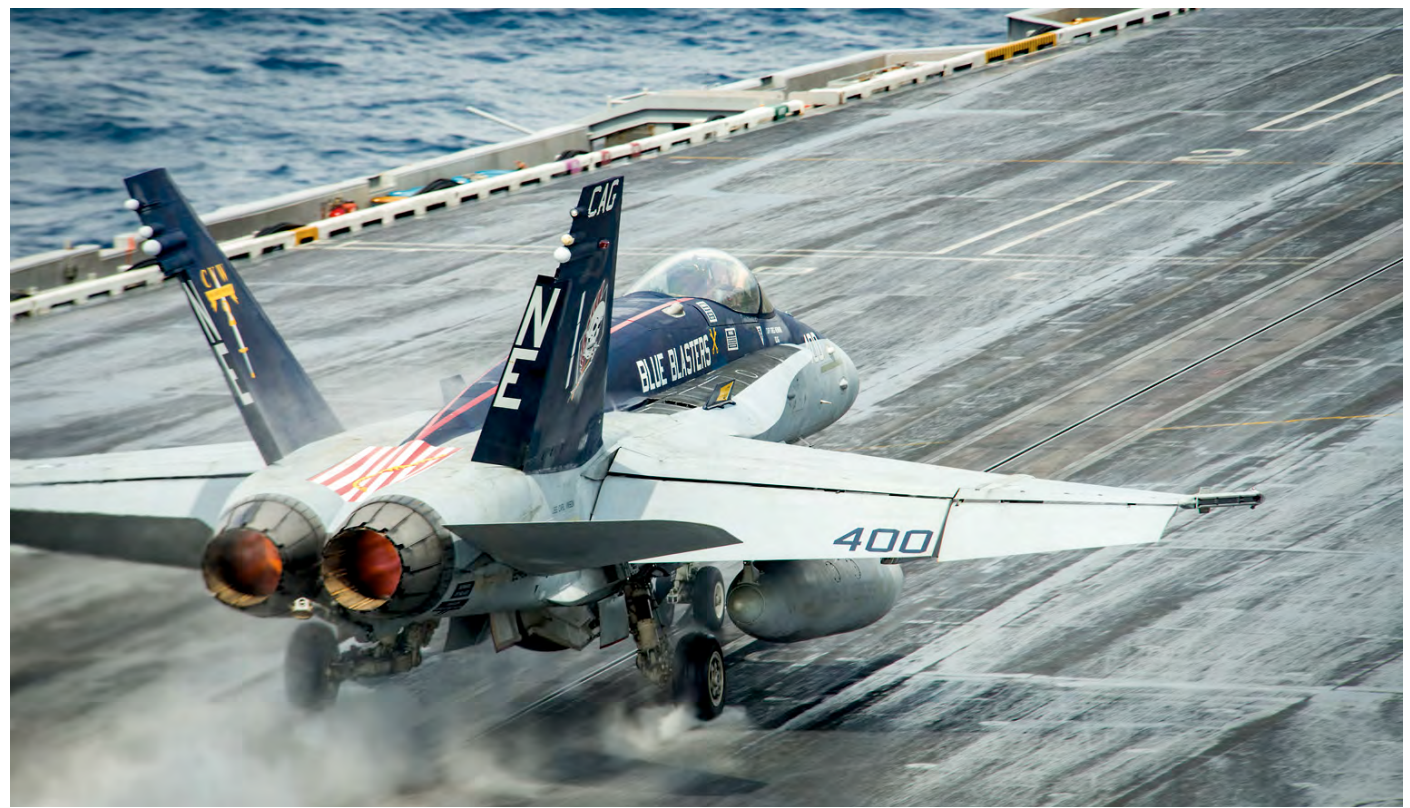
USS Carl Vinson is currently patrolling in the South China Sea. Amongst its embarked air assets is VFA-34, whose "boss bird" is seen here blasting off the deck. (13 March 2018,)

The USAF announced on 21 February 2018, that the Advanced Pilot Trainer (T-X), that is intended to replace the Northrop T-38C Talon trainers at the existing undergraduate pilot training bases, will most probably initially arrive at Joint Base San Antonio-Randolph (TX). Randolph houses the 12th Fighter Wing, that commands two RA tail coded T-38C squadrons, the 435th FTS Black Eagles and 560th FTS Chargin Cheetahs. Both squadrons still have strong ties with the USAF's history in Vietnam. It has been stated that the future T-X, an aircraft that the USAF still has to choose from a running competition, will be arriving at Randolph, as the preferred first base from 2022. The other possible USAF locations for future T-X basing