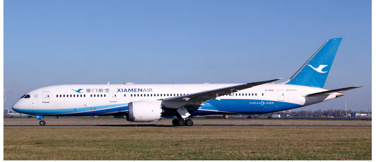
B-7838 is one of twelve Boeing 787 dreamliners in the Xiamen Airlines fleet. The aircraft was the third B787-9 delivered to the carrier on 4 April 2017.