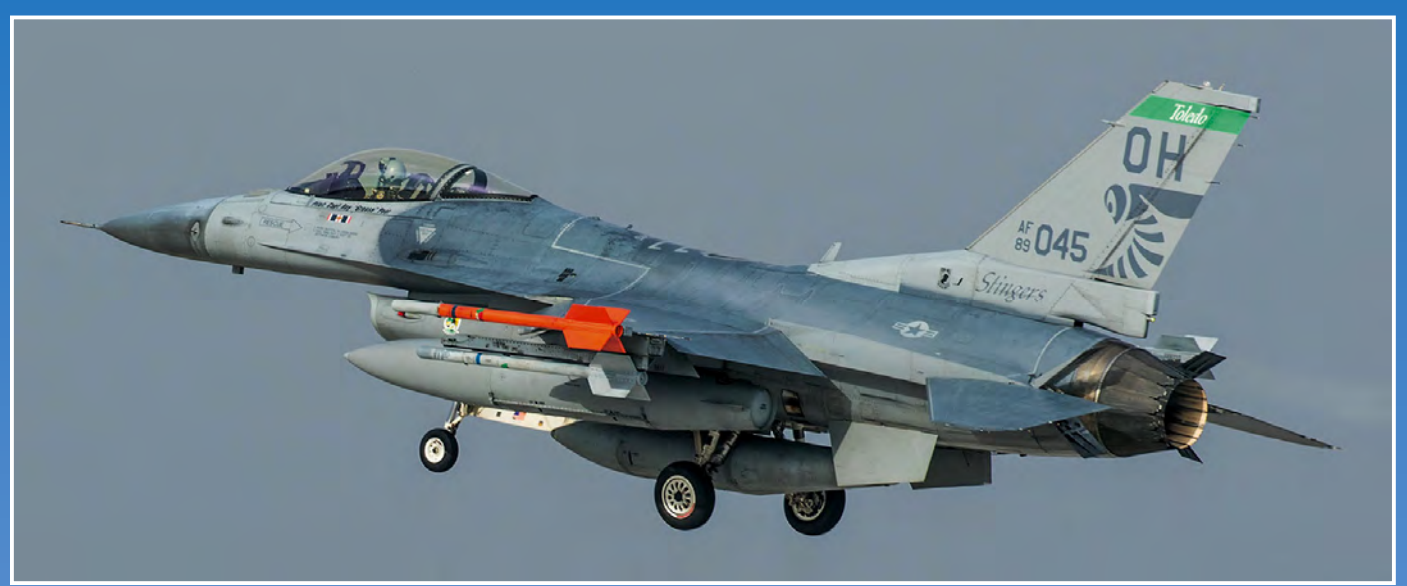
More CONUS-based F-16s visited Spangdahlem following their European deployment to Estonia. (89-2045/OH, 112th FS OH ANG,)