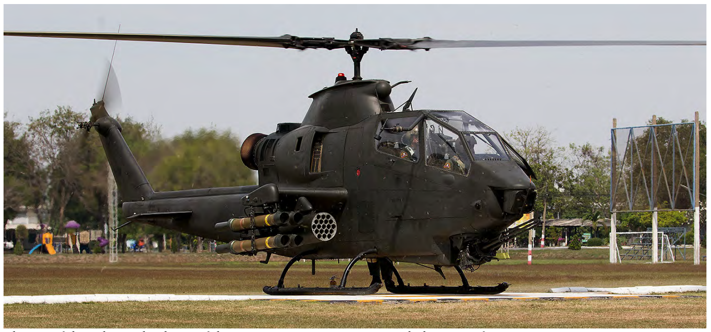
The rise of the Cobra is the theme of this picture page. First an untamed Thai Army first generation AH-1F 15958 seen at Lop Buri. (13 January 2018, Jurgen van Toor)