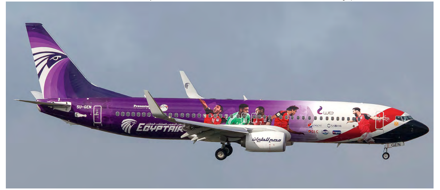
EgyptAir took delivery of this 737-800 SU-GEN early December 2017. On delivery the aircraft was painted in the standard EgyptAir colours. Only three months later, in March 2018, they were replaced with this striking special colour scheme in support of the Egyptian national football team for the FIFA World Cup Football 2018, being held this summer in Russia. (Amsterdam-Schiphol, 22 March 2018, Mischa Oordijk)