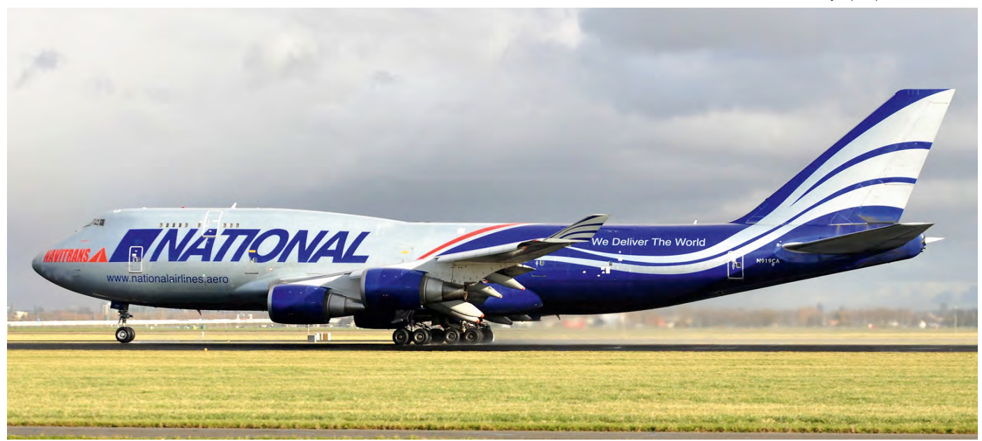
National Airlines and NaviTrans USA launched a round-the-world Boeing 747-400 freighter service on 9 June 2017. Dedicated aircraft N919CA was caught on camera by Frank Doornbos on 2 February 2018 at Amsterdam-Schiphol Airport with additional NaviTrans titles while operating a flight from Miami to Charleston as NCR628/629.