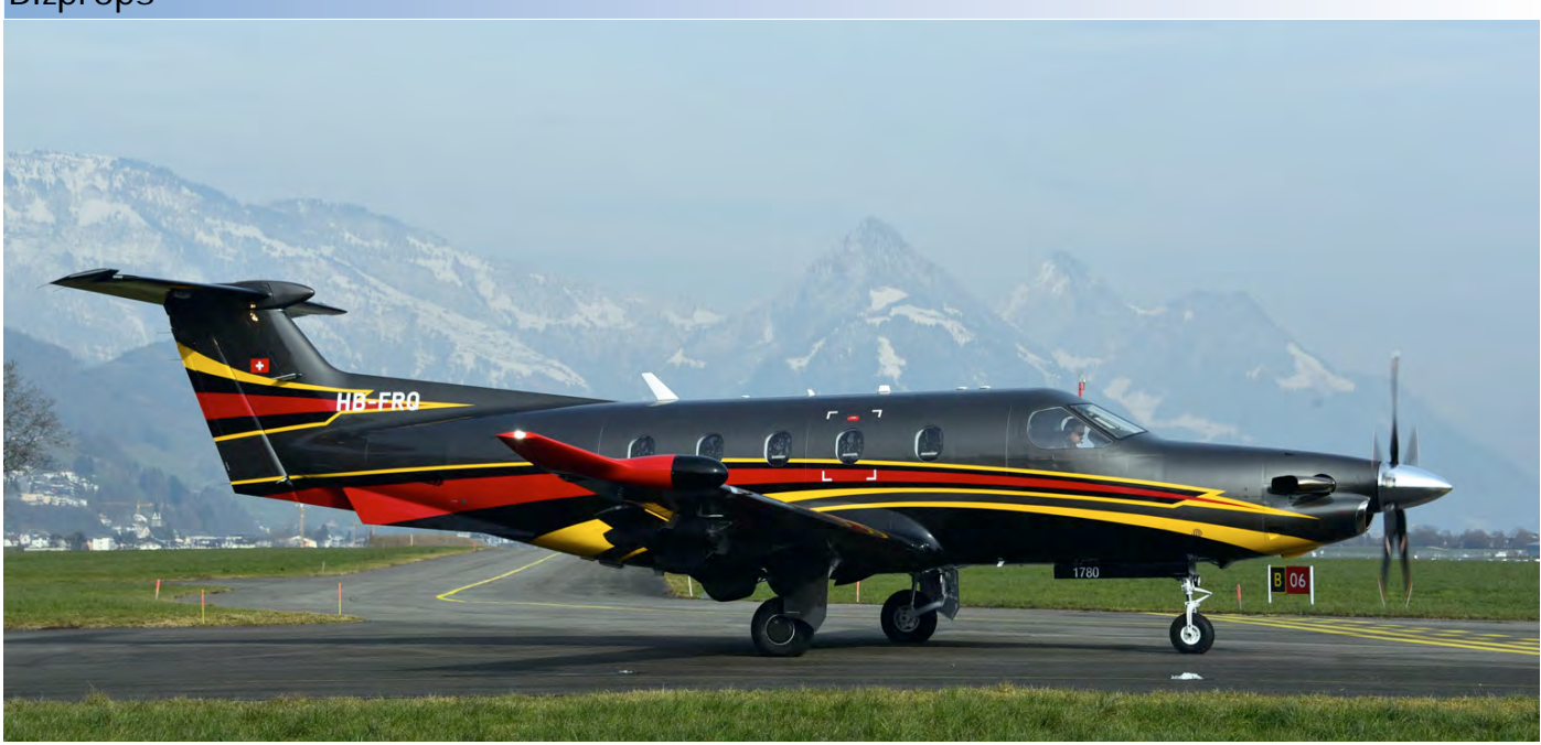
Pilatus PC-12s are known for all having a unique colour scheme of their own, some of them are looking very smart, as demonstrated by HB-FRQ (to be D-FEEL) which is ready to be delivered to its first owner. (Stans-Buochs, 28 February 2018, Stephan Widmer)