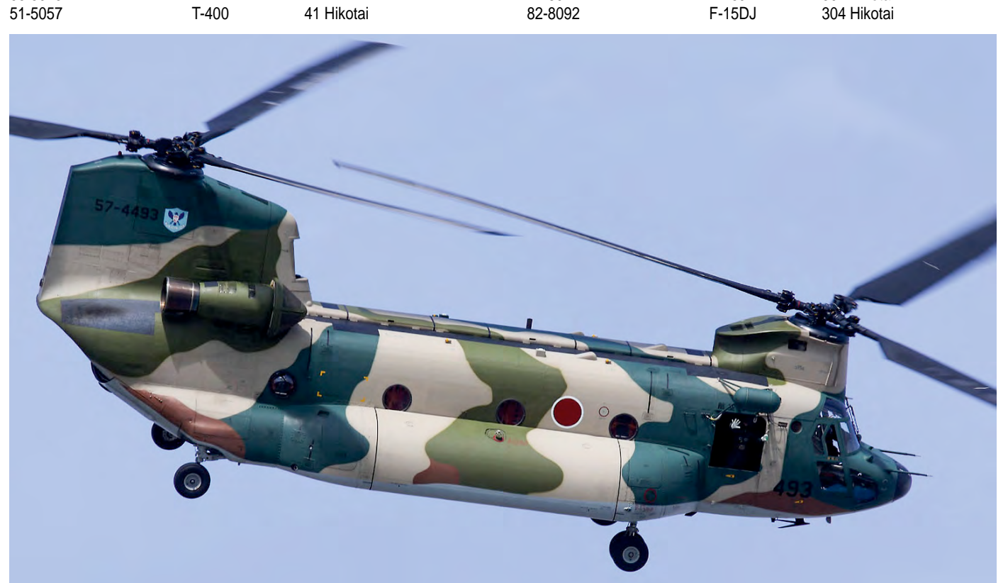
Naha airshow is the place to be to see both JASDF and JGSDF CH-47J/JAs! Okinawa is a joyful place to visit anyway.