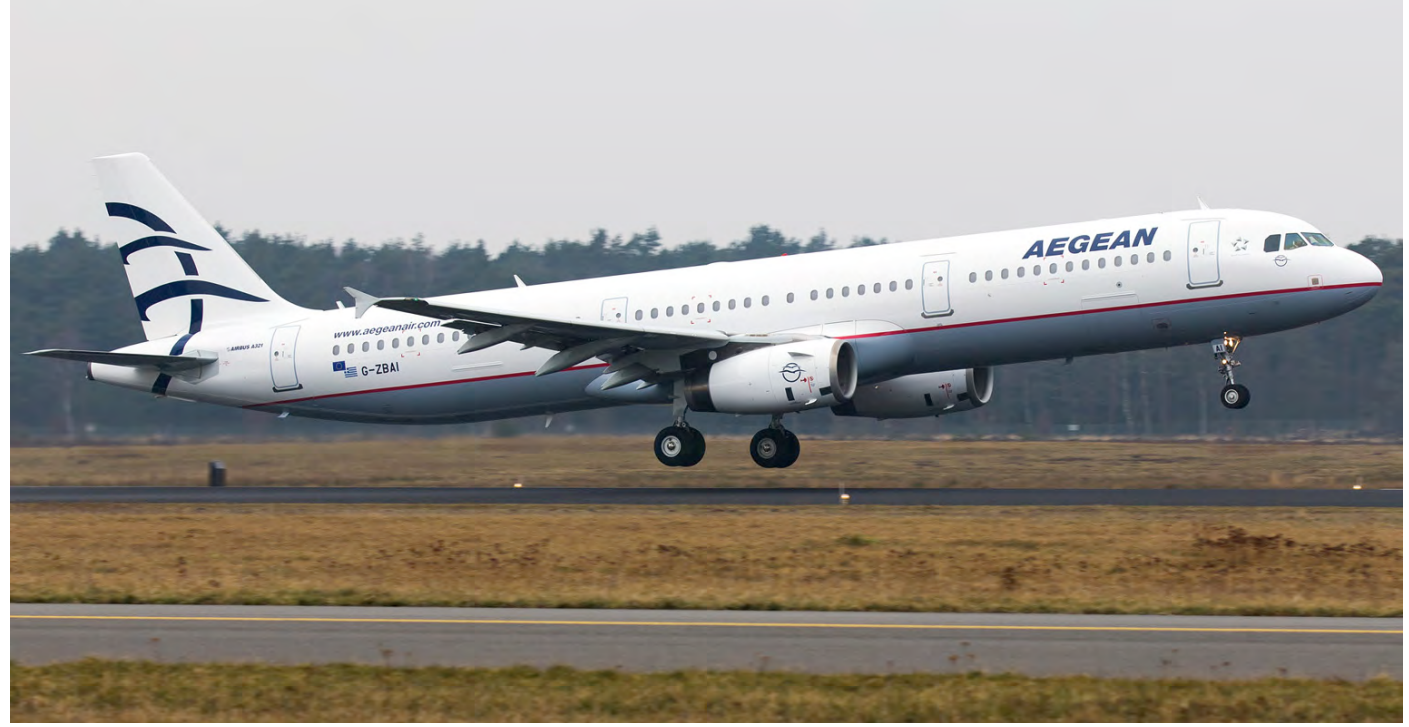
After its bankruptcy many Monarch aircraft found a new home with new operators. Airbus A321 G-ZBAI ended up with Greek Aegean Airlines. It is seen here during a test flight at Woensdrecht where it had been stored since 6 October 2017. It was finally delivered to Athens and registered as SX-DNF on 9 March. (Woensdrecht, 20 February 2018, Johan Havelaar)

During a visit to Brazil, the Moroccan Prime Minister talked about the possibility to order more ERJs for <u>Royal Air Maroc</u>. The airline is currently finishing up its selection process for new regional jets and have been looking to offers from Bombardier, Embraer and Sukhoi. If the talks in Brazil meant that the airline is ready and favouring Embraer is yet unknown.