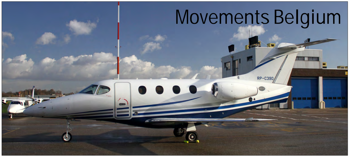
Raytheon 390 RP-C390 was acquired by AEV Aviation in 2007. Aboitiz Equity Ventures (AEV) is a Philippine holding company based in Manilla. Phillipine registered bizjets are rarely seen in Europe. The aircraft was reportedly on a ferry to the USA. (Antwerp, 12 February 2018,)