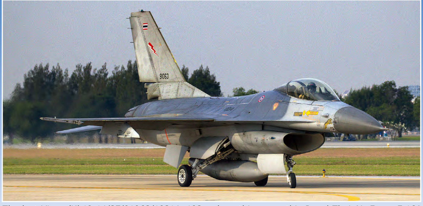
The last Viper (Kh19-14/37/91063/10314, 103sqn) on this page, this Royal Thai Air Force F-16A was seen at Don Muang. (Jim Walg, 13 January 2018)