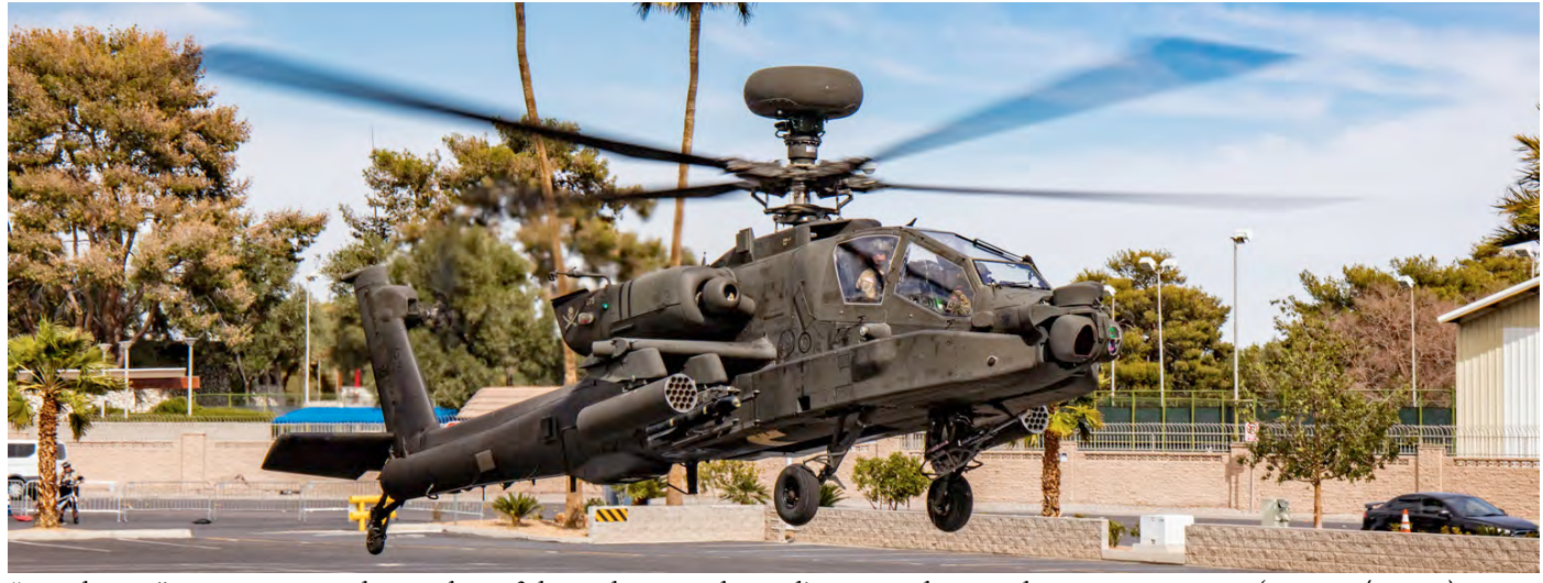
"Guard 95675", an AH-64D Apache Longbow of the Utah National Guard's 1st Battalion, 211th Aviation Regiment (ATTACK/RECON) arrives for HAI's 2018 Heli-Expo. 1-211 provides statewide aviation support to JFHQ and civil authorities in support of emergency preparedness and homeland defense operations.