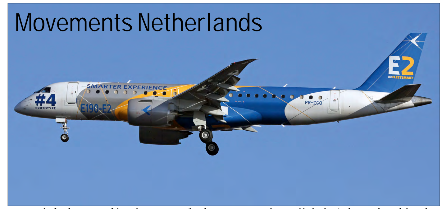
PR-ZGQ is the fourth prototype of the Embraer ERJ190-E2 (listed as ERJ190E2STD in the Scramble database). The aircraft spend the night at Schiphol-East before it continued to Norway, visiting launch customer Widerøe. On 28 February 2018 Embraer has received airworthiness certification for the E190-E2 from Brazilian, European and US regulators. In time for the first delivery to launch operator Widerøe set in April 2018. (Amsterdam-Schiphol, 24 February 2018,)