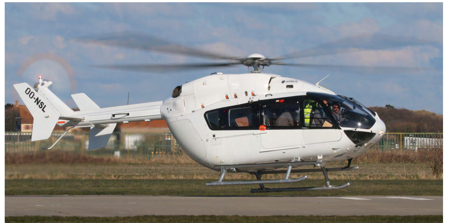
This EC145 was delivered new to Pegaso in Brazil as XA-UPT in 2011. It was returned to leasing company Milestone Aviation Asset Holding Group in November 2016 and registered as G-CJMI, while they stored it at Bonn. It was delivered from Bonn to Ostend on 8 February 2018 as OO-NSL. On 29 March 2018 the helicopter was photographed with SAMU markings. It is believed to be the new SAMU 62, replacing OO-NHB. (Ostend, 27 February 2018,)

Credits: Replo.be, Copters-list.