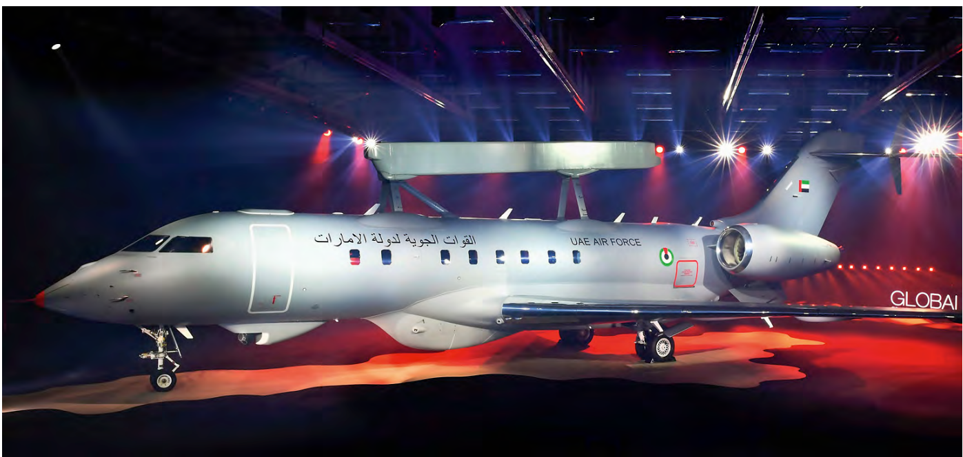
At its home in Linkoping, Saab recently presented the Global Eye, a heavily modified Bombardier Global business jet for its launch customer, the United Arab Emirates Air Force. (21 February 2018,)

At least one of the former US Department of State Cessna 208B Caravans has been spotted flying with its US civil registration and bearing a small Pakistani flag on the tail.