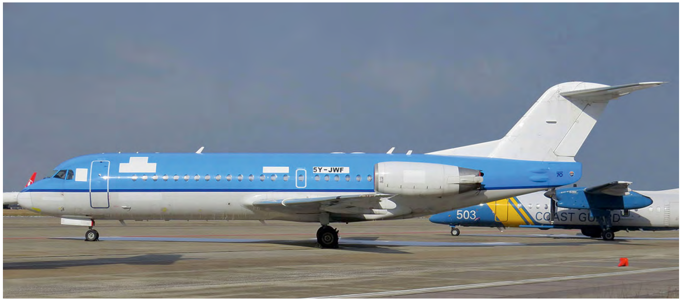
Former PH-KZK was ferried by KLM Cityhopper from Amsterdam to Maastricht on 28 October 2017 after completing its return flight from Brussels that same day. 5Y-JWF was planned to depart Maastricht on 25 January 2018 on delivery to Jetways Airlines but the delivery flight seems to have been indefinitely delayed. (Maastricht-Aachen, 26 February 2018)