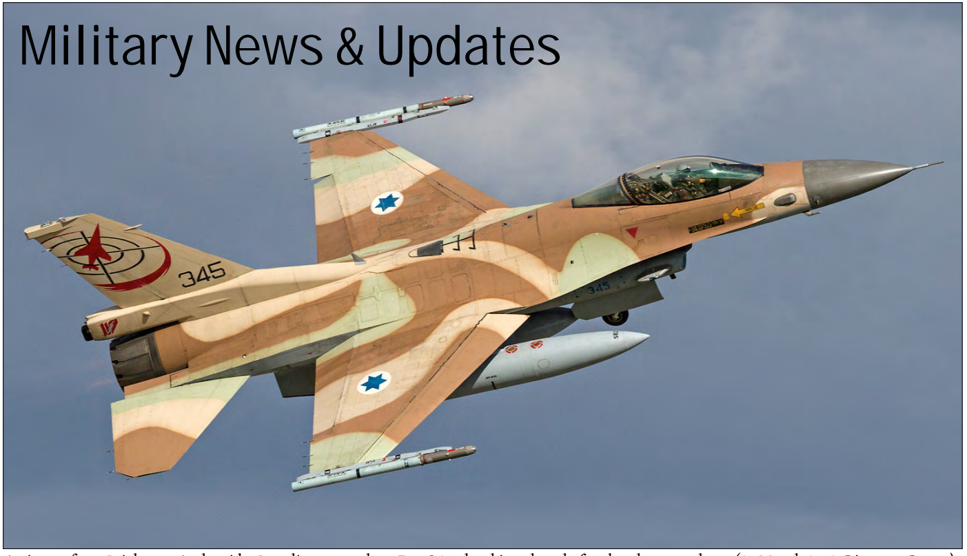
A picture from Iniohos at Andravida, Israeli 117 squadron F-16C 345 banking sharply for the photographers. (20 March 2018, Dino van Doorn)

Because of our standardization we sometimes use type, unit and serial presentations that may strongly differ from those used by the manufacturer or user. It is therefore possible that the information sent by you can deviate from the information we publish.