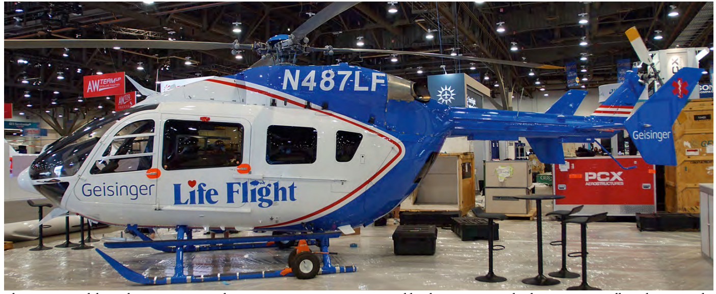
This EC145 was delivered as N958AL in April 2009. From August 2017 it is owned by the Geisinger Medical Center at Danville and operates the Geisinger LifeFlight air ambulance service as N487LF. (Las Vegas (NV), 26 February 2018,)