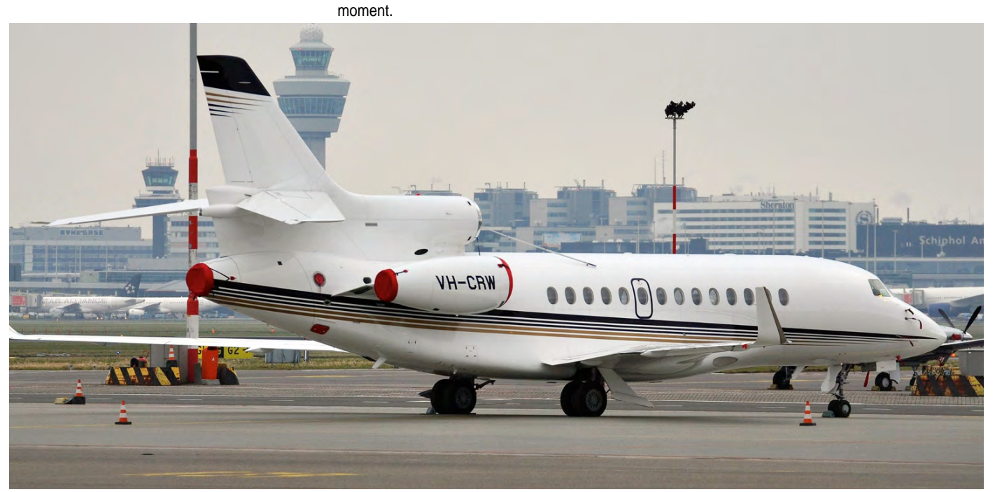
Visits of Australian business aircraft to western Europe are quite rare and therefore very welcome. This Falcon 7X VH-CRW of Brenzil visited Amsterdam-Schiphol in February. (Amsterdam-Schiphol, 5 February 2018,)