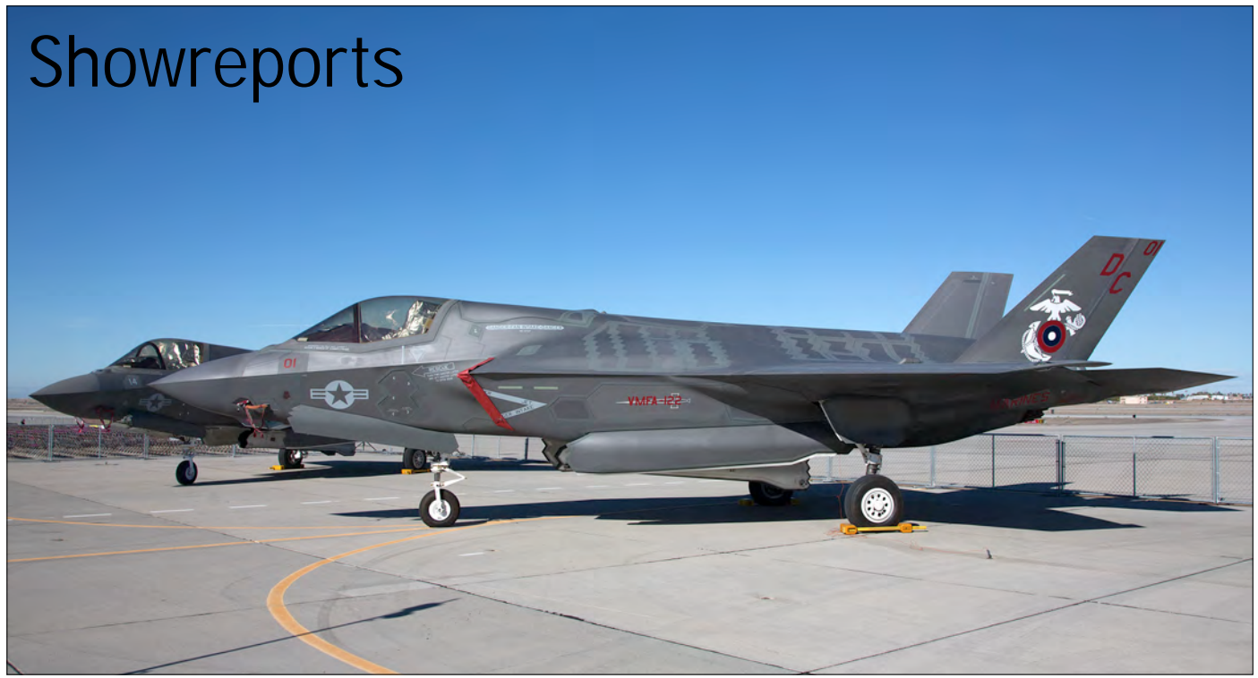
The first F-35Bs for VMFA-122 were revealed recently at Yuma and could be admired by the local population during the airshow. (168732/DC-01, 17 March 2018, Melchior Timmers)