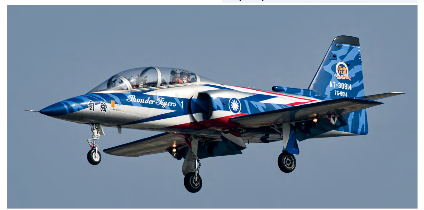
If you want to see the AT-3, Taiwan is the only place to be. The Thunder Tigers theme is clearly visible in the colourscheme on this example. (0814/75-6014, AT-3, Kangshan, 24 February 2018, Ben Uffen)

LA5009 f/f 24mar18, still with HAL, to be handed over to 45sq late April 2018