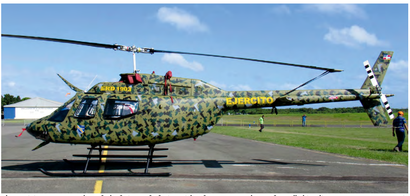
The Dominican army struggles to find a fitting prefix for its serials. After EN, ERD, and no prefix at all, this splinter camo OH-58C onse again shows ERD-1903 as its serial. (ERD-1903, OH-58C, 1er Escuadrilla de Caballeria Aerea, San Isidro, 11 February 2018)