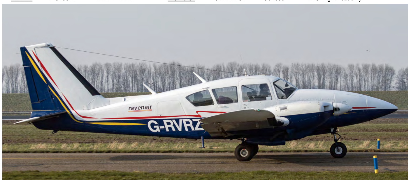
Previously registered as N250MC this Piper 23 was first registered in the UK as G-BSFL in January 1981. The aircraft is owned by Ravenair Aircraft and is being operated by Cheshire Flying Services (trading as Ravenair). The company acquired the aircraft in April 2010 then registered as G-NRSC. It transferred to G-RVRZ in November 2010. (Lelystad, 18 February 2018,)

February 2018 02. PH-ACI CeT303 AIS Flight Academy