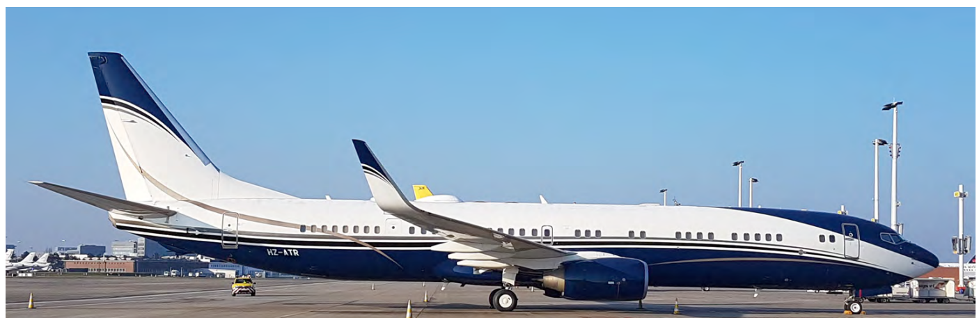
In 2010 a BBJ3 was delivered to Boeing Business Jets as N383BJ. The aircraft spend almost three years at various locations around the world for completion work. In January 2013 it was finally delivered to its customer as HZ-ATR. Al-Atheer Aviation is a private company established in 1983 and located in Riyadh, Saudi Arabia. It is rumoured to be operating this Boeing 737-900 for the Saudi Arabia Ministry of Finance. (Brussels, 23 February 2018,)