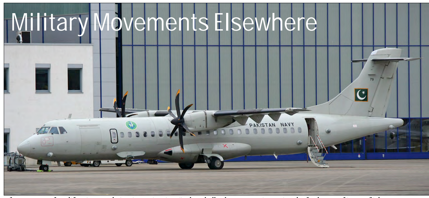
After 1.5 years of modifications at Rhein Air Services in Mönchengladbach, ATR72 79 is nearing the final stage of its test flight programme. It will be delivered back to Pakistan and the next example will then be coming to Germany. (15 March 2018)