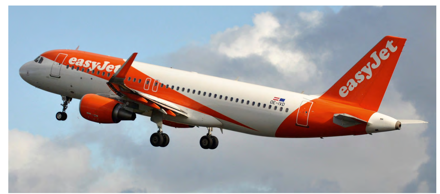
This Airbus A320 was delivered to easyjet in 2016 as G-EZPL. easyJet is one of the airlines taking precautions for when the United Kingdom will exit the European Union. easyJet Europe was established on 18 July 2017 and started operations on 20 July 2017. Its headquarter is located in Vienna, Austria. In November 2017 this Airbus took up registration OE-IVD. (Amsterdam-Schiphol, 2 February 2018, Frank Doornbos)