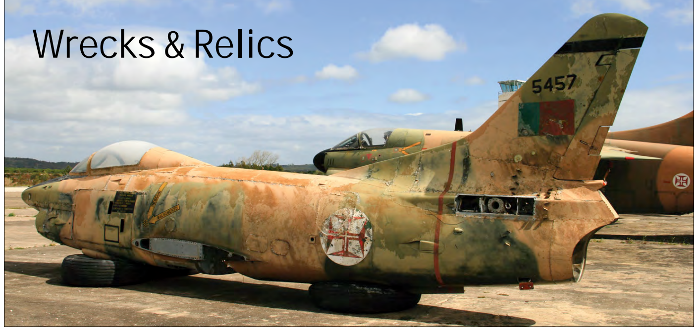
Since 1984 a G91R marked as 5457 was pole mounted at the Air Force Academy at Sintra. This could not have been the original 5457 (c/n 464) as it crashed on 18 February 1981, after an explosion which killed the pilot. In 2017 the Sintra aircraft went to Ota for restoration, allowing its construction number to be checked. It has c/n 341, making it ex German G91R/3 30+79, which was delivered to Portugal for spares. (Ota, 24 March 2018,)