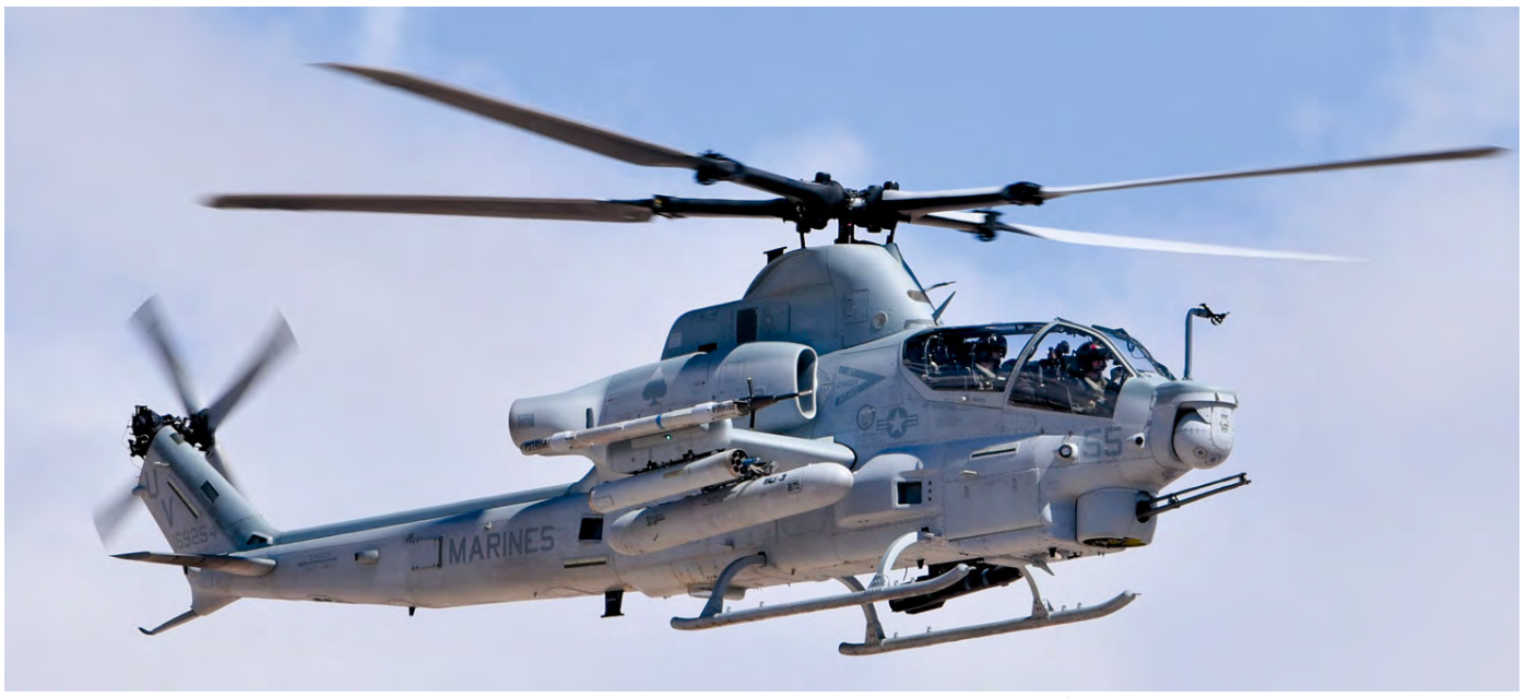
The latest generation is the AH-1Z Viper, with two engines and four blades. BuNo169254/UV-55 of HMLA-267 was seen at Nellis AFB. (14 March 2018)

Personal copy Distribution to a third party is not allowed