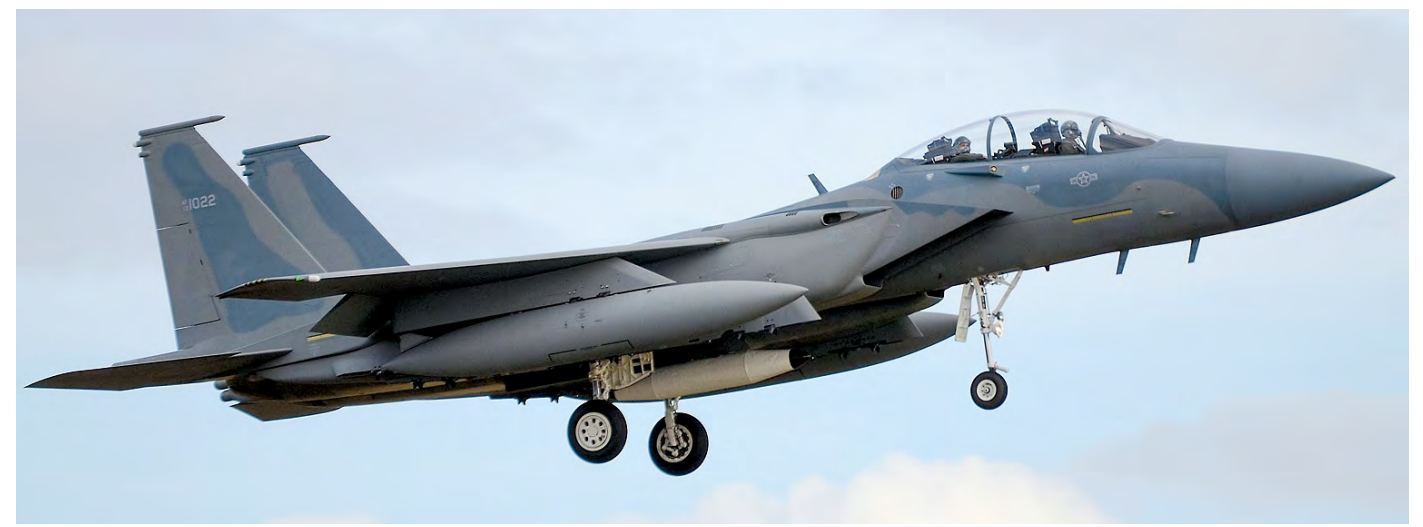
Saudi F-15SA deliveries are well underway. Lakenheath is often used as a convenient stop after crossing the pond on the way to the desert nation. (12-1022, F-15SA, 23 March 2018)

These are all original green Bombardier BD-700-1A10 Global Express 6000 Vision Flight Deck aircraft that are modified as special mission aircraft and destined to end up in the inven-