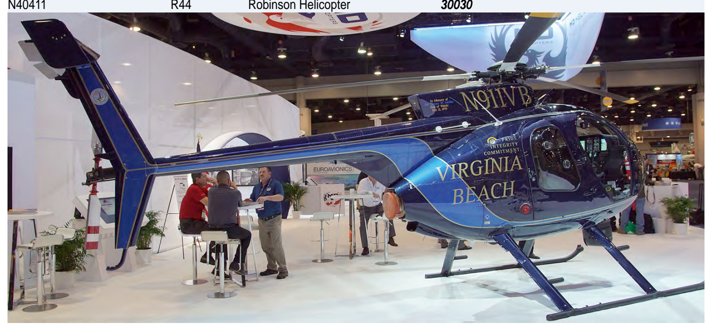
Registration N911VB for this MD530F was reserved on the FAA website on 28 March 2018 by MD Helicopters. The helicopter will be delivered to the Virginia Beach Police department in June 2018. (Las Vegas (NV), 26 February 2018,) Personal copy 94 Distribution to a third party is not allowed