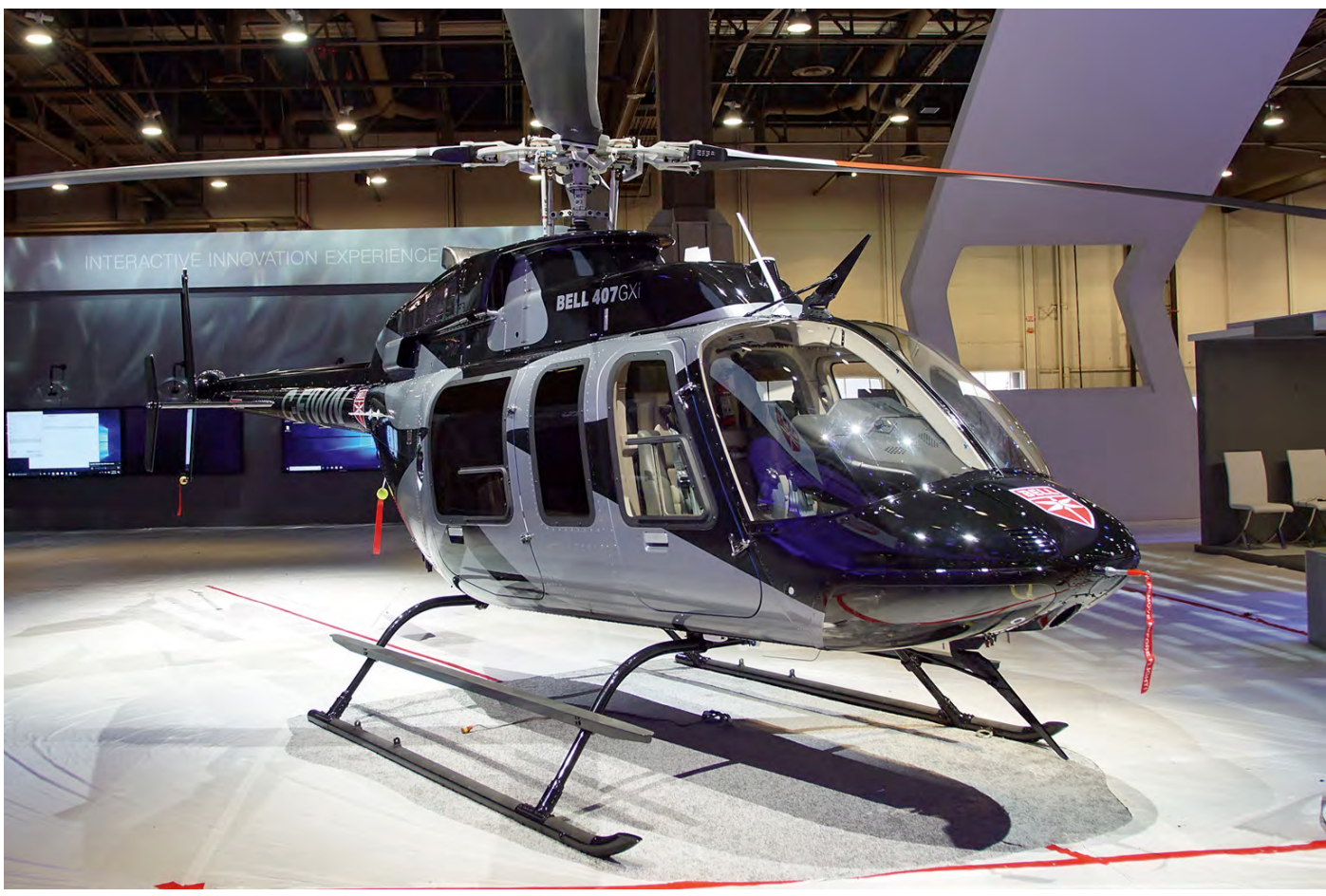
C-FIWN is registered to Bell Helicopters Textron Canada since January 2015. It was seen at the event with Bell 407 GXi marking and the new Bell logo but it is not known if this 2015 frame actually was converted to Bel 407GXi. The GXi is the successor to the GXP. It incorporates new avionics, an upgraded engine, and new executive interior design options. (Las Vegas (NV), 26 February 2018,)

expected to be delivered in May 2018. At Heli-Expo 2018 Bell Helicopter announced the introduction of the Bell 407GXi. The Bell 407GXi incorporates new avionics, an upgraded engine, and new executive interior design options.