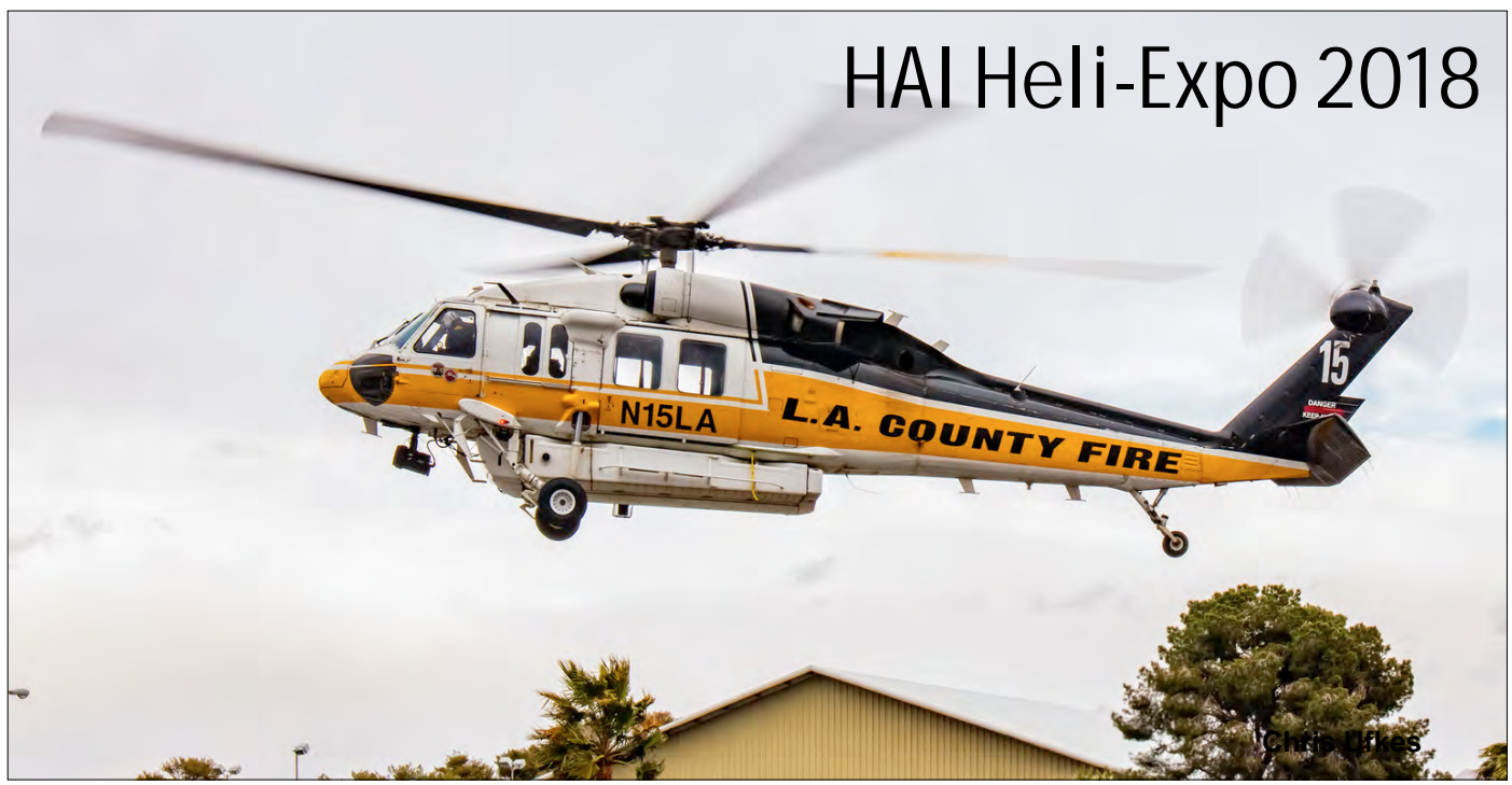
This Sikorsky S-70A Firehawk is owned by City of Los Angeles. N15LA is used by the LA County fire department. It is one of three in the current fleet with a fourth S-70 recently ordered. (Las Vegas (NV), 23 February 2018,)

The annual HAI Heli-Expo took place at Las Vegas (NV) from 27 February 2018 till 1 March 2018.