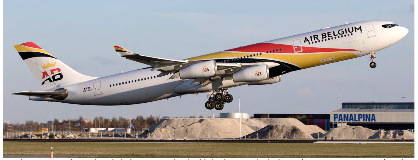
Air Belgium is a new Belgian airline which plans to operate long haul flights from Brussels-Charleroi to destinations in Asia , primarily to China and India. Planned equipment are four ex Finnair Airbus A340-300s. Two of them have already been delivered. Air Belgium will start their own flights to Asia on 16 April and prior before that date, they offer ACMI services. Surinam Airways was their first customer and on 29 March OO-ABA operated the Surinam flight from Amsterdam to Paramaribo, marking the first Air Belgium commercial flight. (Amsterdam-Schiphol, 29 March 2018, Joris Termorshuizen)