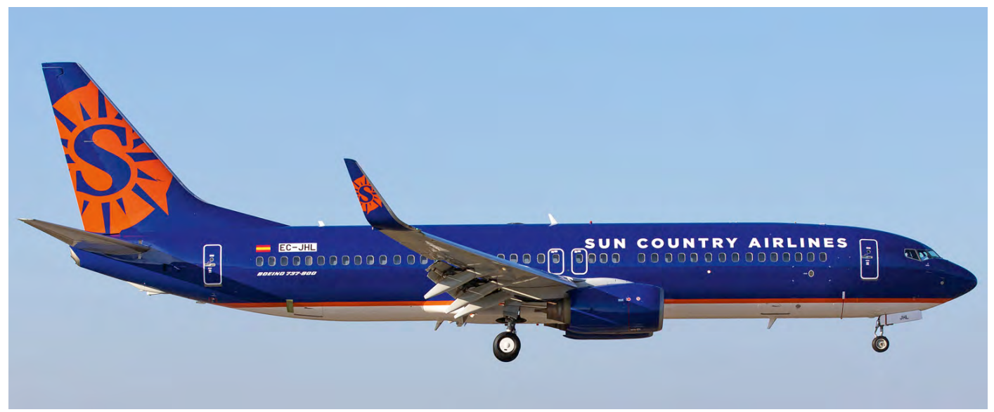
Boeing 737 EC-JHL was delivered to Air Europa in July 2005. It was withdrawn from use in January 2018 and ferried to Woensdrecht. The aircraft was photographed when it returned most probably from its acceptance flight. It departed as N824SY via Amsterdam to Melbourne International (FL) on 5 March 2018. (Woensdrecht, 22 February 2018, Johan Havelaar)