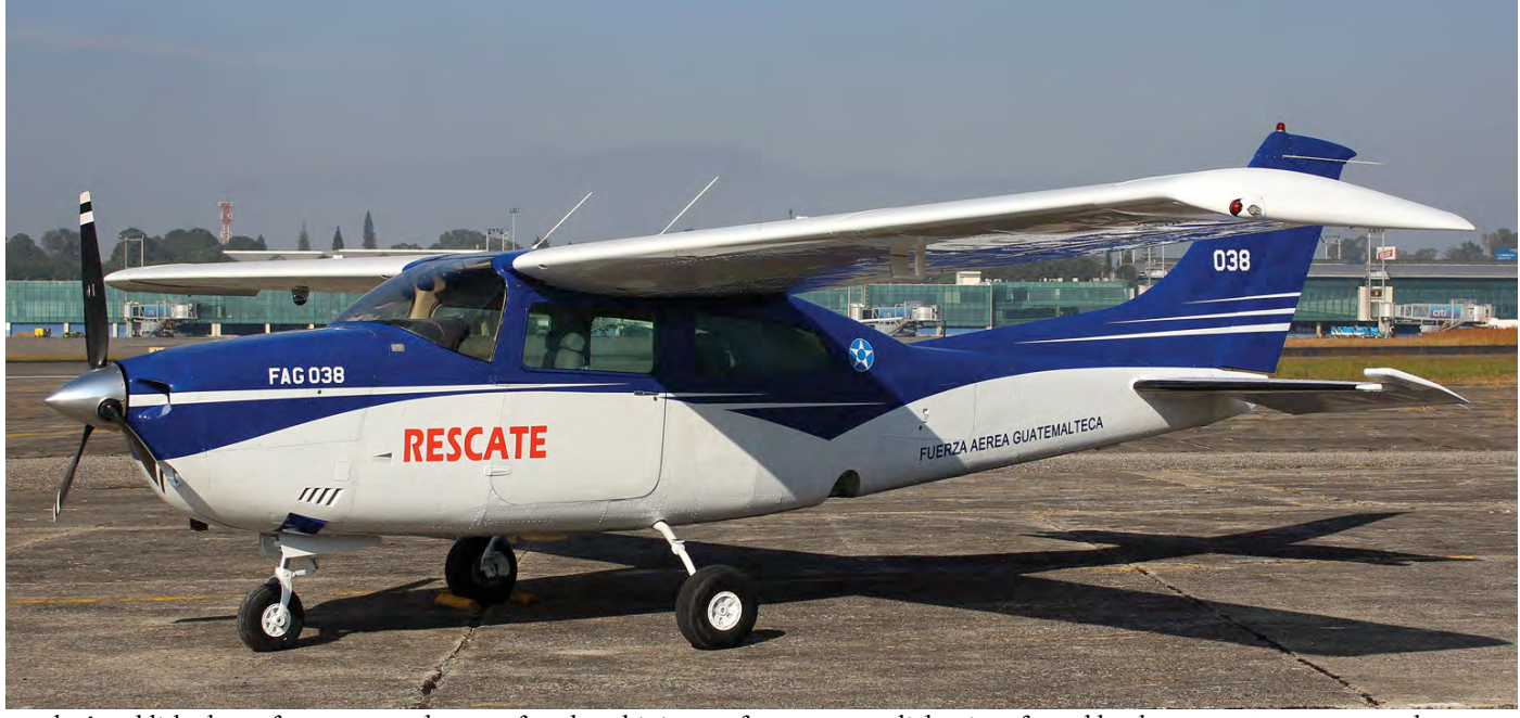
We don't publish photos from Guatemala very often, but this is one of many Cessna light aircraft used by the Fuerza Aerea Guatemalteca over the years. 038 was impounded on 21 March 2009, and pressed into service some time later. The air force operates a varied assortment of light aircraft, most are impounded drug-running aircraft. (Guatemala City-La Aurora, 4 December 2016, Carlos Rubio Herrera)