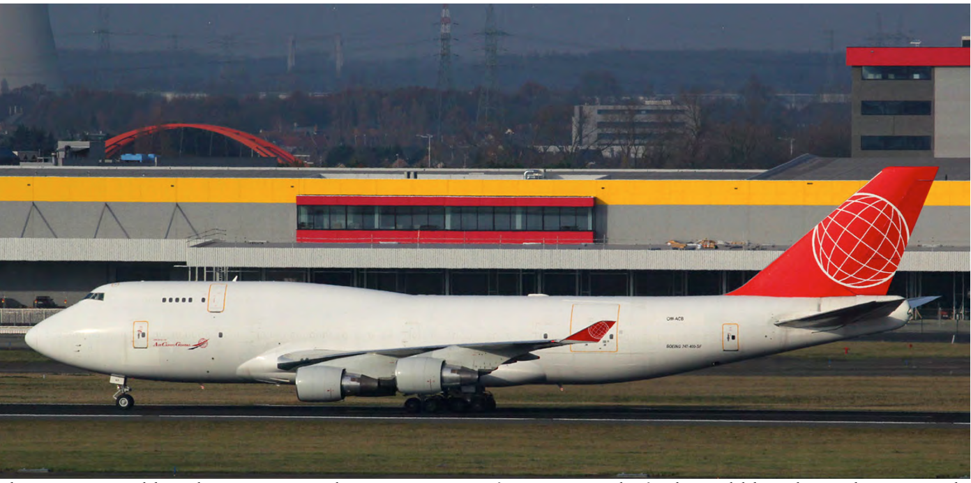
This Bo summe