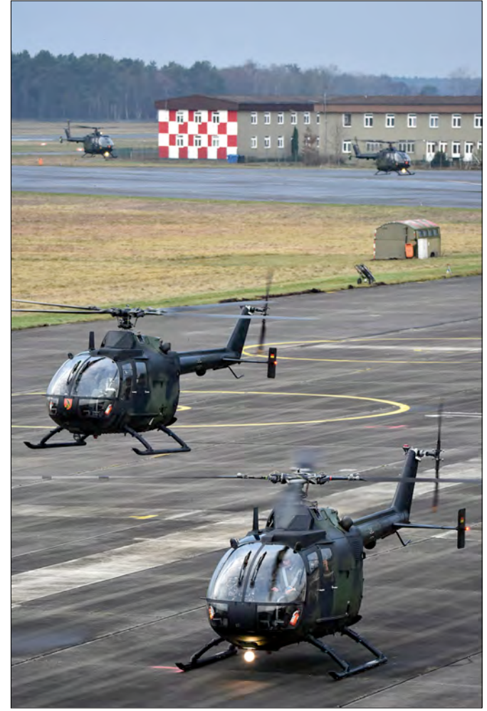
43 years of Bo105 operationes came to the end on 13 December by a final 18-ship farewell formation at Celle airfield.

The airfield was first in use by the Deutsche Wehrmacht from 1933 till 1945. After World War II the Royal Air Force used this airfield for the famous air-bridge to Berlin in 1948 and 1949. The airfield was returned to the German Luftwaffe in 1957 and is now in use by the German Army.