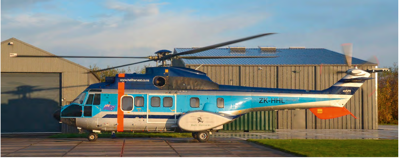
This Super Puma was delivered to the Prefectural Police in Japan in 1988. Heli Harvest in New Zealand added this helicopter to its fleet in 2013. It arrived by ship in Zeebrugge and was flown from Knokke-Heist to Austria where is was photographed at the Heli-Austria home base St Johann two days after this photo was taken. Registration OE-XLP has been allocated for this AS332L1. (Knokke-Heist/Westkapelle Heliport, 8 November 2016,)