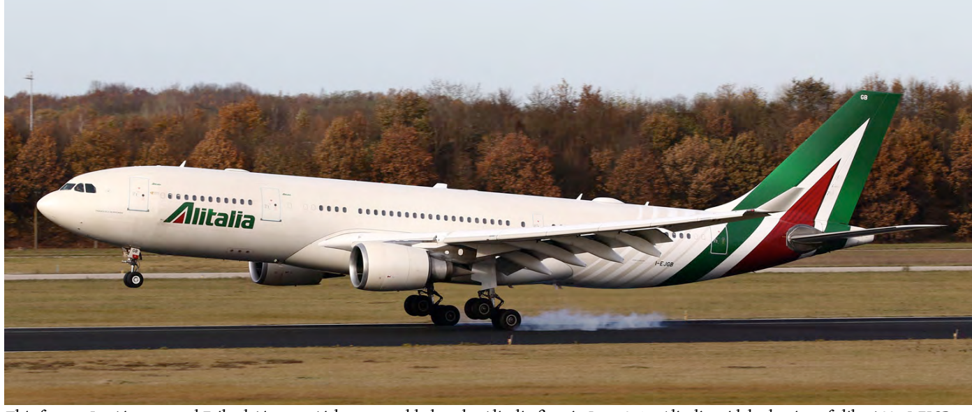
This former Jet Airways and Etihad Airways Airbus was added to the Alitalia fleet in June 2015. Alitalia widebody aircraft like A330 I-EJGB are rarely seen in the Netherlands. (Eindhoven, 22 November 2016, Jeroen Stroes)