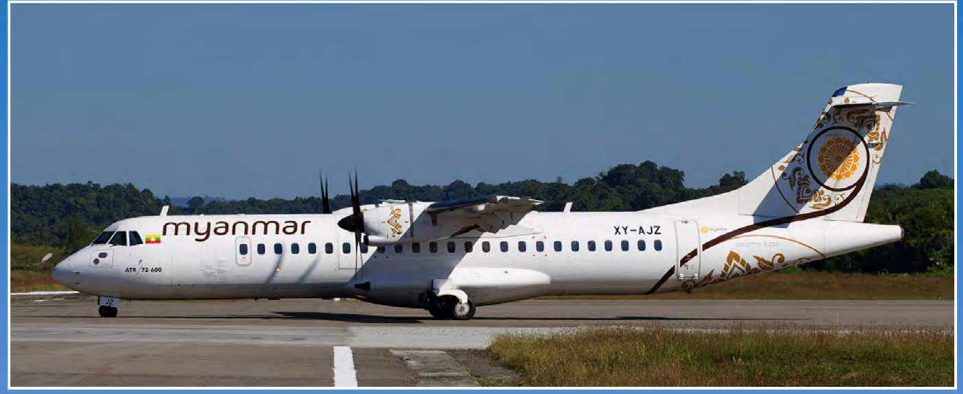
It looks like that Thandwe is visited by a lot of ATRs. ATR72-212 XY-AJZ was delivered to the national carrier of the country Myanmar National Airlines. It was delivered about a year before this picture was taken. (5 December 2016,)