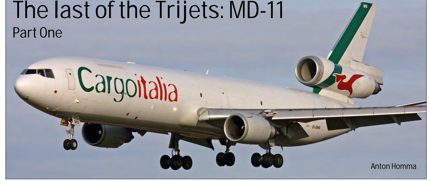
Now that the MD-11 is phased out in the Netherlands, we thought it was time to present you with a large article about this beautiful aircraft. Shown on this picture is MD-11F EI-EMS of Cargoitalia. Nowadays, l/n 600 is not flying anymore, but it is stored at Victorville (CA). (Liege, 11 December 2011, Arjen Sleeuwenhoek)

The last MD-11-operator in The Netherlands, Martinair Cargo, has recently phased out their MD-11s and so we at Scramble thought it was time to publish an extensive overview of this elegant aircraft. This is part one of the article, part two will follow in Scramble 453.