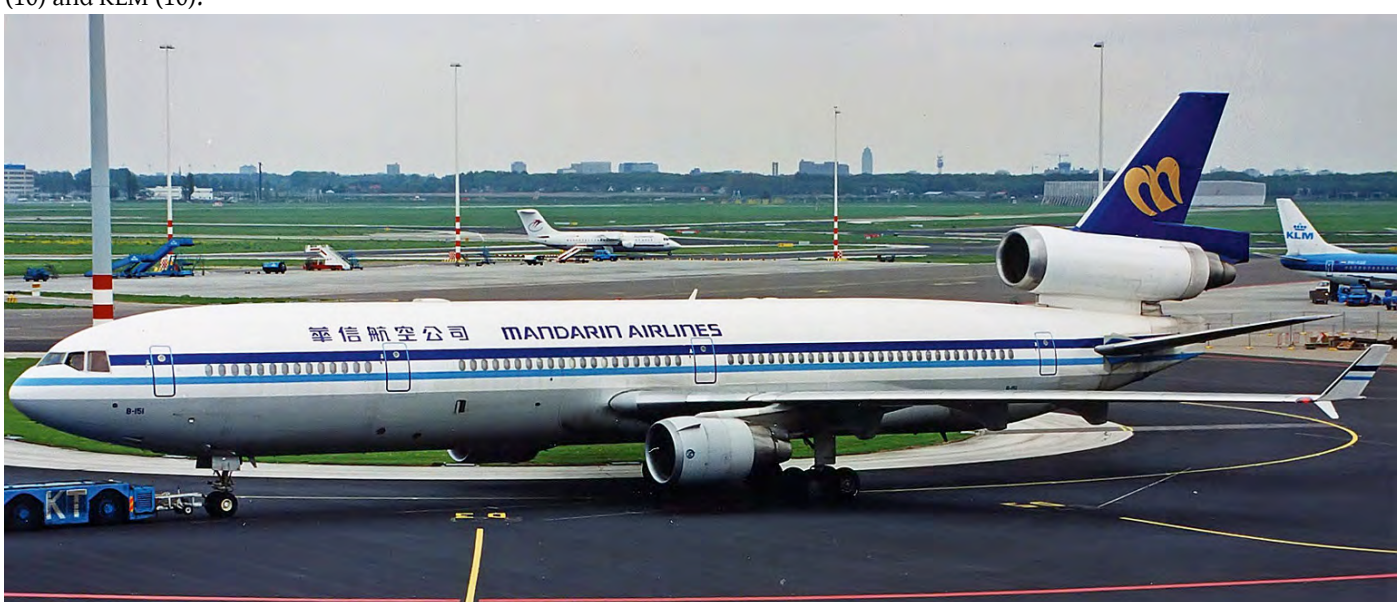
China Airlines placed their MD-11s with subsidiary Mandarin Airlines for a while and flew them to various destinations, including Schiphol. Pictured here is B-151, which is l/n 519. She ended her flying career with FedEx and is now stored at Victorville (CA). (Amsterdam, 19 May 1996,)

McDonnell-Douglas undertook various studies for other variants of the MD-11, the MD-XX. The MD-XX would have been offered in a stretched version and a long-range version. Later on the project changed into the MD-12-programmeme which would have had four engines and a double decker fuselage. By 1996 the plans were cancelled due to the financial struggles at the manufacturer.