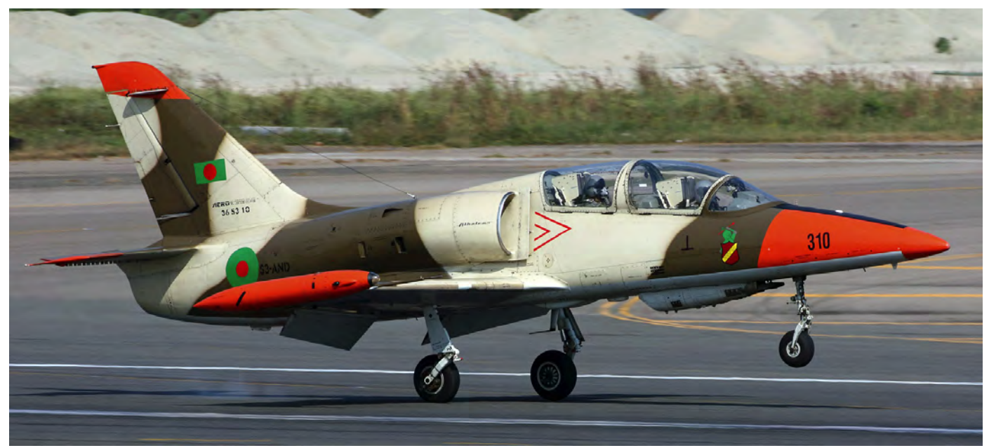
The L-39ZA is an armed variant of the well known Czech trainer. Serial 310 was first noted in December 1998, and is still going strong. (130, L-39ZA, Dhaka, 16 December 2016)