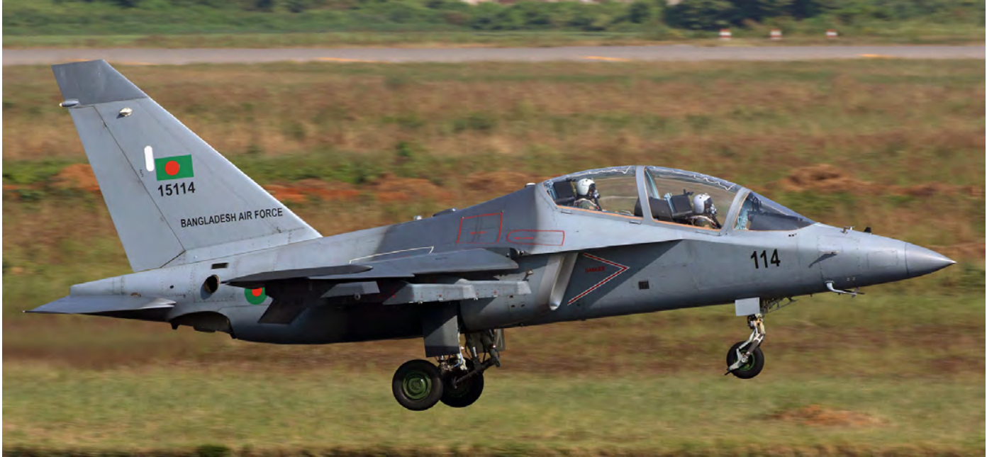
This cover page is dedicated to jet training in Bangladesh. A recent delivery is the Yak-130 advanced trainer. (15114, Yak-130, 21sq, Dhaka, 16 December 2016)