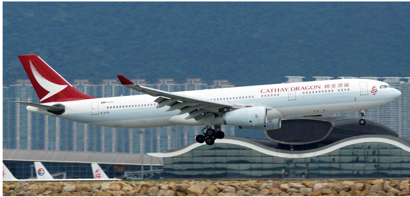
Early 2016 Cathay Pacific announced that it would rebrand its subsidiary Dragonair as Cathay Dragon. In the course of 2016 many Dragonair aircraft were painted in the new Cathay Dragon livery as shown in this picture of Airbus A330-300 B-HYQ. The new brand became officially active on 21 November 2016. (Hong Kong, 18 June 2016,)

Personal copy Distribution to a third party is not allowed