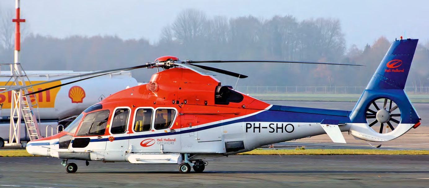
CHC Helicopters Netherlands took delivery of this Eurocopter EC155B1 in 2006. It was operational in the offshore industry from the start but was withdrawn from use in October 2016. PH-SHO was sold to Heli Holland and delivered to the company heliport in Emmen on 2 November in basic CHC colours but has since received titles and a tail logo. (Groningen, 25 November 2016,)

Personal copy Distribution to a third party is not allowed