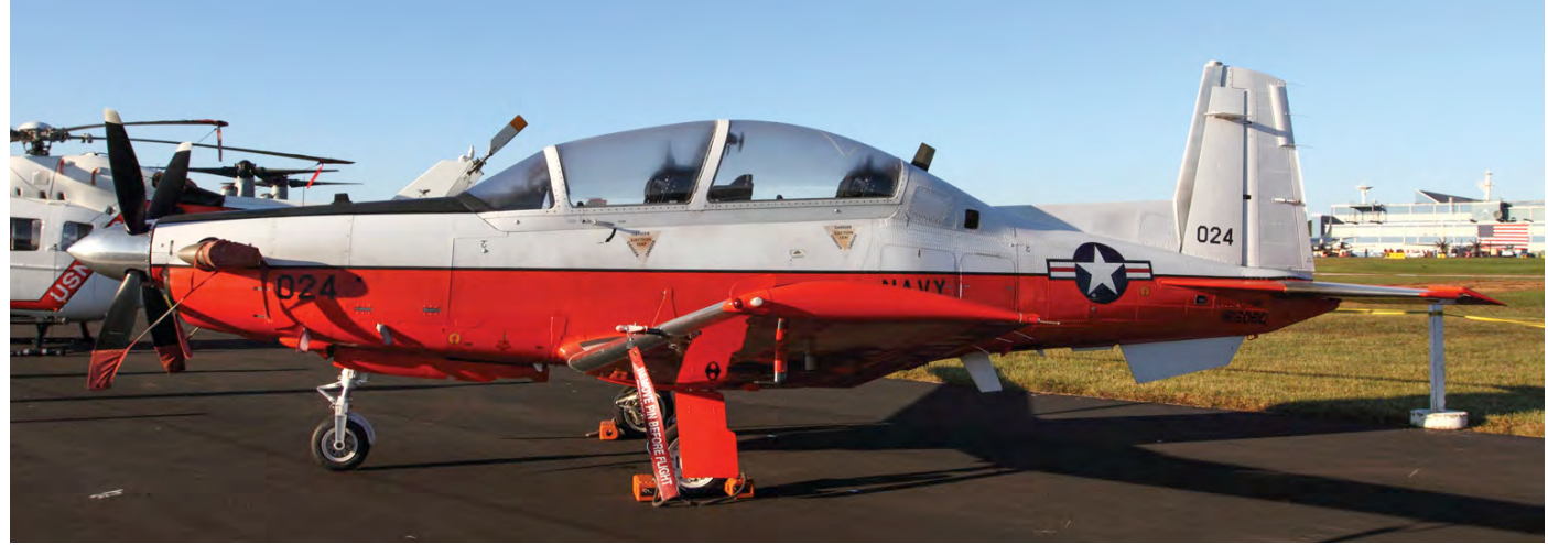
The US Naval Test Pilot School operates many exotic types. Among one of the regular types is this T-6B 166060 with code 024. (NAS Patuxent River (MD), 29 October 2016,)