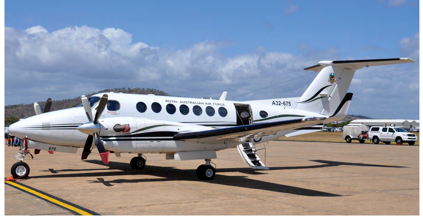
A32-675 is one of a dozen King Air 350s operated by 38 Squadron. Most of the King Airs were an interim replacement for the venerable DHC-4 Caribou, which was operated by the RAAF for 45 years. Recently, full replacement was begun by introducing the C-27J Spartan. (RAAF Townsville, 16 October 2016, Jonathan Verschuuren)