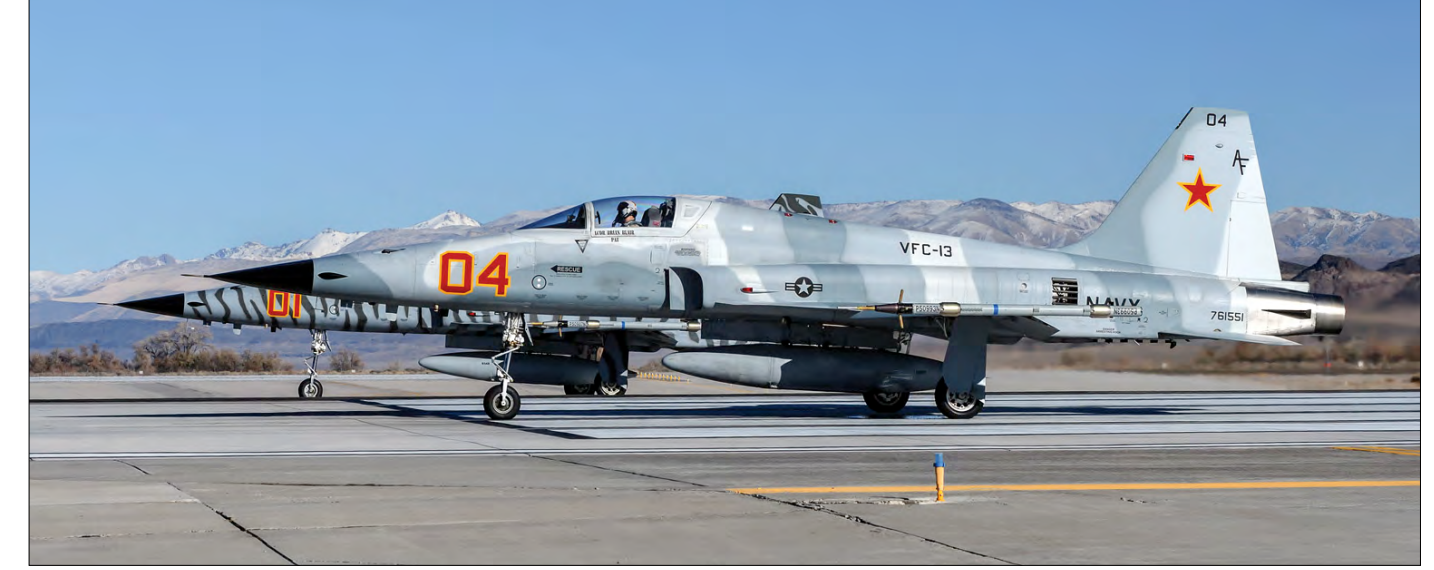
No relation to this edition's SIS, but just a nice shot of F-5E 761551/AF-04 from VFC-13 on the runway at NAS Fallon (NV), with the snow-capped peaks of the Sierra Nevada in the background. (2 December 2016, Bert Stil)