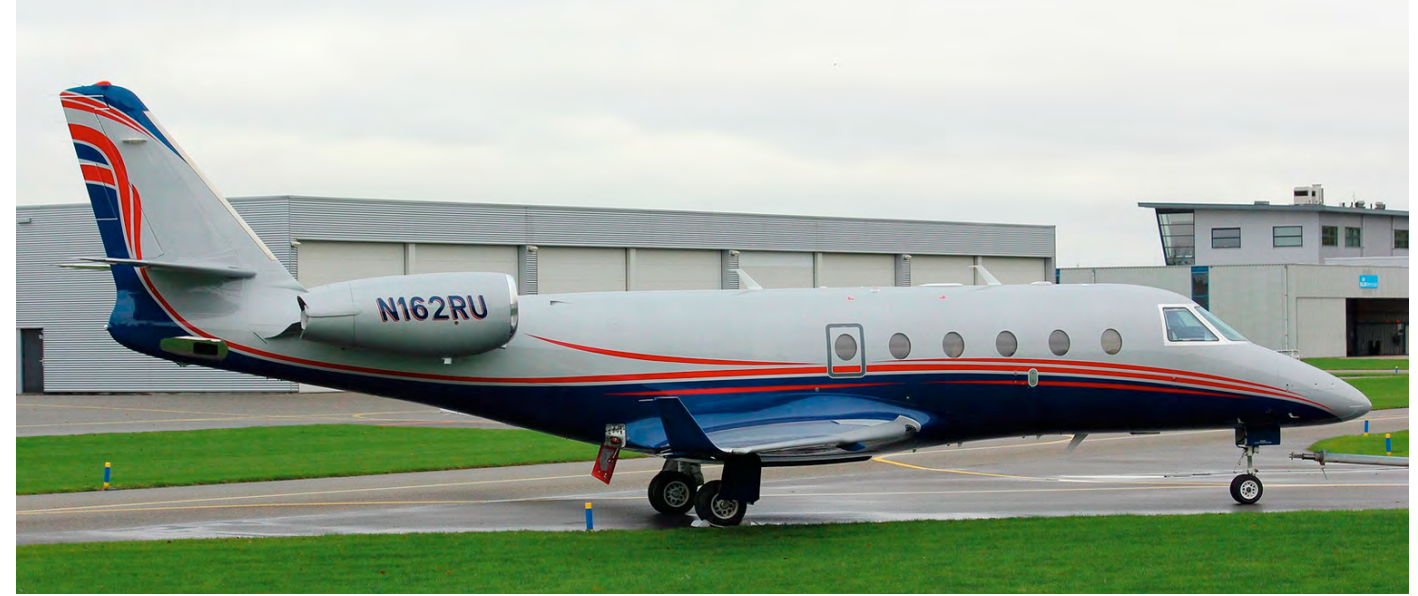
In 2017 the last ever Gulfstream 150 will be delivered to its owner. N162RU was registered in 2007 to Gulfstream Aerospace. It was added to the fleet of Hinson Corporate Flight Services in March of this year and arrived at QAPS for a fresh coat of paint last month. (Lelystad, 7 November 2016,)