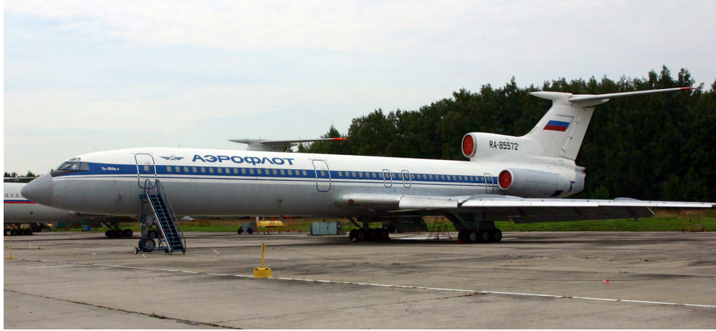
Russian Federation Force flight RFF7091, of the Russian Air Force and operated by Tupolev 154 RA-85572, was destroyed when it impacted the waters of the Black Sea shortly after take-off from Sochi Airport on Christmas Day. Among the 92 persons onboard was the Alexandrovaka Red Army Choir, an official army choir of the Russian armed forces, which was flying to Latakia to perform for the troops based in Syria. Sadly they never got to listen to the choir as everybody perished in the crash. (Chkalovsky, 19 August 2009,)