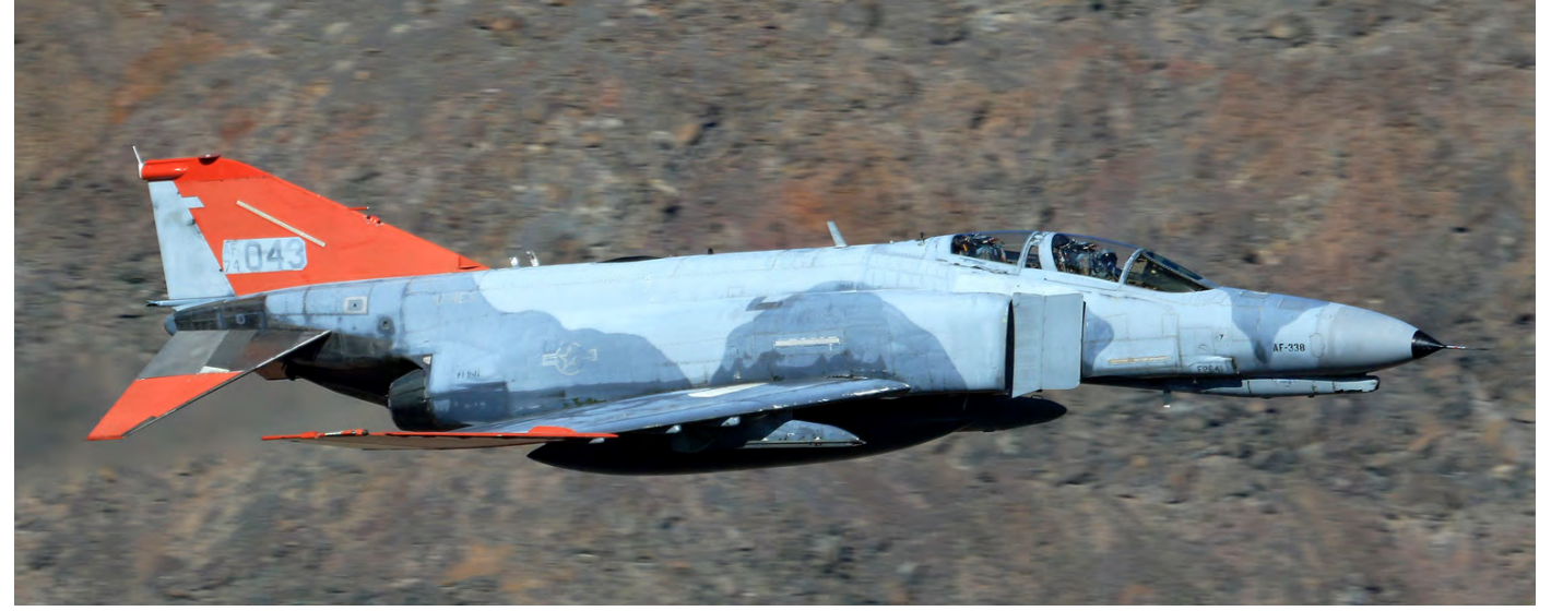
74-1043/AF-338 was one of the four QF-4Es in the final flight on 21 December 2016. It is painted in an experimental two-tone grey (cloud) camouflage adopted by the 906th FW/704th FS based at Bergstrom (TX) in the 1980s. Like the opening photo of this article, it was photographed by Gerhard Plomitzer while going through Rainbow Canyon on 25 October 2016.