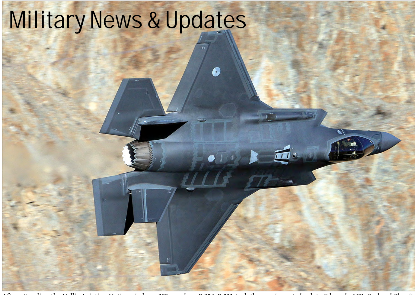
After attending the Nellis Aviation Nation airshow, 323squadron F-35A F-001 took the scenic route back to Edwards AFB. Gerhard Plomitzer spent some time in the famous Rainbow Canyon and saw the Lightning II during one of the various passes on 14 November 2016.

Because of our standardization we sometimes use type, unit and serial presentations that may strongly differ from those used by the manufacturer or user. It is therefore possible that the information sent by you can deviate from the information we publish.