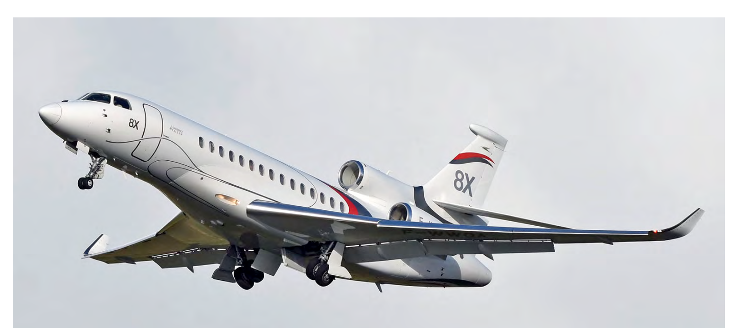
F-WWQA is the first Falcon 8X that took to the air in February 2015. In the final stages of the flight test and certification campaign the aircraft visited Den Helder for some cross wind approaches. (Den Helder, 2 November 2016, Kees van der Mark)