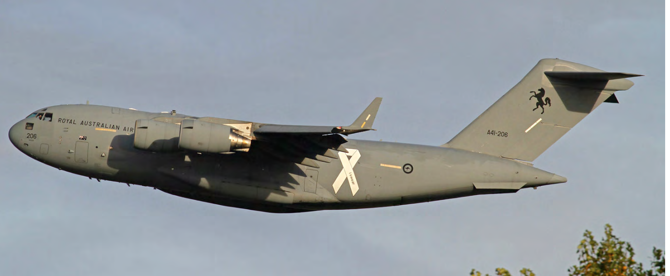
A local plane spotter was present at Rockhampton Airport on 23 July 2015 to capture the first images of this Royal Australian Air Force Globemaster III wearing a white ribbon in support of 'White Ribbon Day' - Australia's campaign to stop violence against women. White Ribbon Australia is a non-profit organisation and Australia's only nationally male-led primary prevention campaign to end men's violence against women. C-17A A41-206 is no stranger to the Netherlands as it was also involved in the aftermath of the MH17 disaster. (Amsterdam-Schiphol, 3 November 2016, René Verschuur)