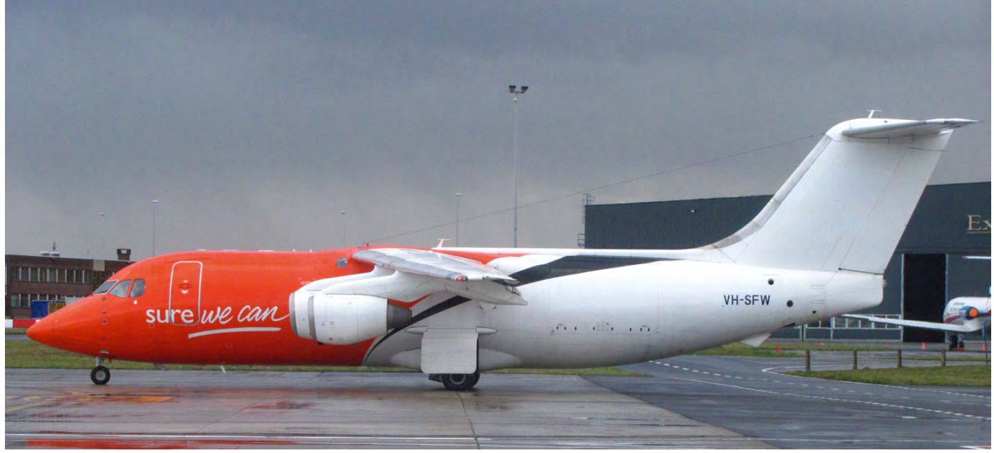
Virgin Australia Cargo was launched in July 2015. The airline signed a five-year carriage contract with TNT earlier in 2016 and operations of dedicated freighter aircraft commenced two weeks later. Most aircraft are leased from Pionair and operated by their subsidiary Skyforce Aviation. BAe146 VH-SFW is former Pan Air EC-FZE, hence the basic TNT colours. The aircraft was caught on camera shortly before departing to Australia. (Brussels, 18 November 2016, Eric Vangeel)