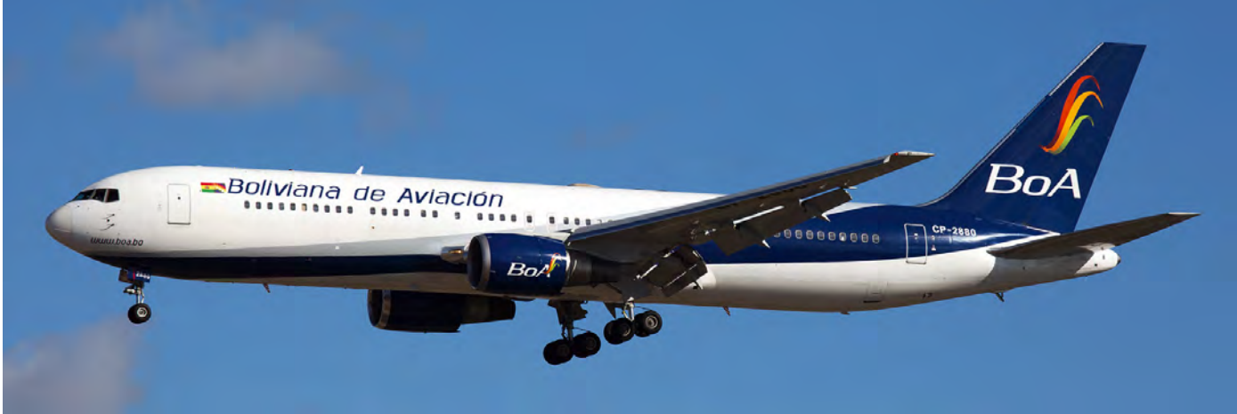
Boliviana de Aviacion is based at Cochabamba and started operations in 2007. It has a fleet of two CRJs, nineteen Boeing 737s and three Boeing 767s. Their sole destination in Europe is Madrid where B767 CP-2880 was seen on 13 November 2016.