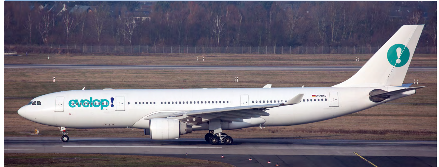
Turbulent times at Air Berlin, as the airline is in the midst of a fleet restructuring phase to make the airline profitable after many years of heavy financial loses. Air Berlin has ended all their in-house 737 operations (the airline now only operates thirteen 737s wet-leased from TUIFly) and in the coming months forty Airbus A320s will leave Air Berlin's fleet and will be transferred to the Lufthansa group. Under the project name "the new airberlin", the airline will reduce its European and regional network drastically from around 140 destinations to only seventy, but will expand its long-haul business. Air Berlin's own fleet would consist of 75 aircraft in the future: seventeen Airbus A330-200s for long-haul operations while forty Airbus A320 family aircraft and eighteen Bombardier Q400 aircraft will be kept to serve European routes. This will mean that Air Berlin's base Dusseldorf on 8 December and was ferried on 22 December to Abu Dhabi for painting in full colours. The aircraft is seen lining up for departure to Abu Dhabi still in full Evelop colours but already with its new German registration D-ABXG. The two other A330-200s, which will join Air Berlin's fleet in the coming months, are ex TAM Brasil aircraft. (Marcus Steidele)