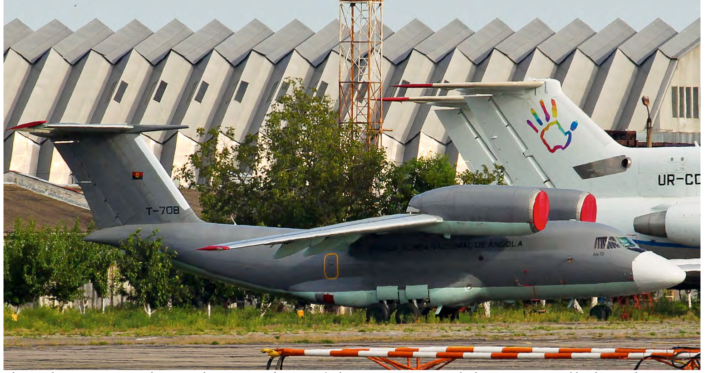
Also at Odessa's storage area (next to Yak-42D UR-COD) you can find Antonov An-74 T-708 which is or was operated by the Angolan Air Force. André Alders was able to photograph all aircraft on 9 August 2016 at the aforementioned area.

After a short stop i flew with the An-140 further to Lviv where i spent the day in a really nice city centre.