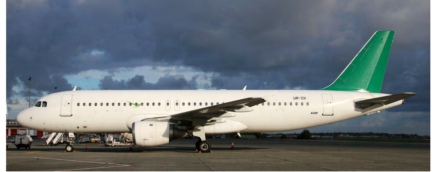
Delivered in 1994 to Gulf Air, this Airbus A320 has seen most parts of the globe during its lifetime. The aircraft has flown in the Middle East, Africa, Europe and Asia. The green tail is a remnant of a two years flying career with R Airlines in Thailand. Ukranian airline DART added this aircraft to its fleet in May 2016 as UR-CII. (Ostend, 2 November 2016,)