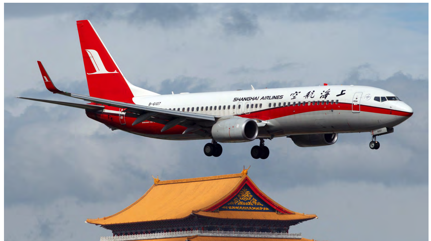
Shanghai Airlines Boeing 737 B-6107 is just seconds away from landing at Taipei's second airport Songshan. In the background you see the top of Grand Hotel Taipei. (Taipei SongShan, 25 November 2016, Marcel J. van Bielder)