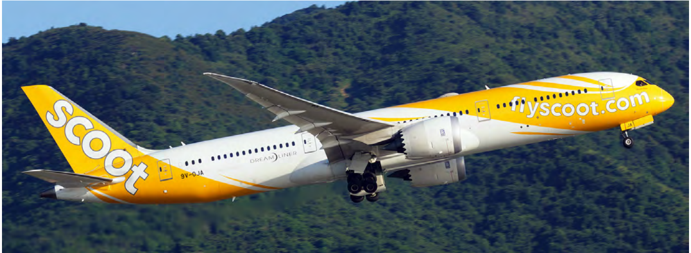
Scoot is a Singapore based low-cost airline and a subsidiary of Singapore Airlines. They have a fleet of twelve Boeing 787 aircraft. Six of the 8-series and six of the 9-series. Scoot's first European destination will be Athens starting from the summer of 2017. 9V-OJA was seen here during take-off at Hong Kong. (29 July 2016, Aad Rehorst)