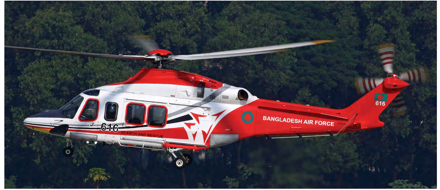
We continue with this Bangladesh Air Force AW139, 616 with full SAR markings. This helicopter is part of the 1squadron and has 613 as sistership. Both were delivered one year ago by AgustaWestland. (Dhaka-International, 16 December 2016,)