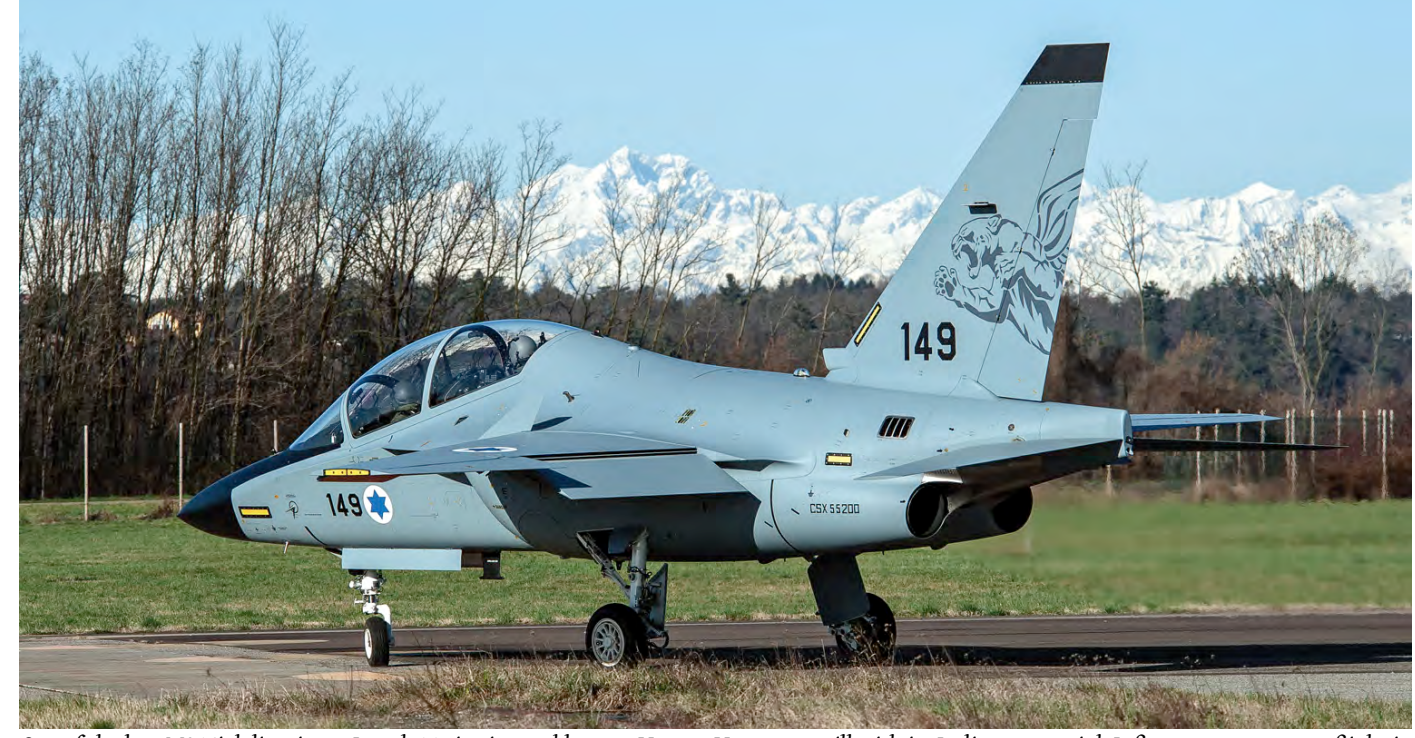
One of the last M346i deliveries to Israel, 149 is pictured here at Varese-Venegono still with its Italian test serial. It flew one acceptance flight in these full markings in the morning of 1 March 2016 before delivery to Israel on the same day in the afternoon.