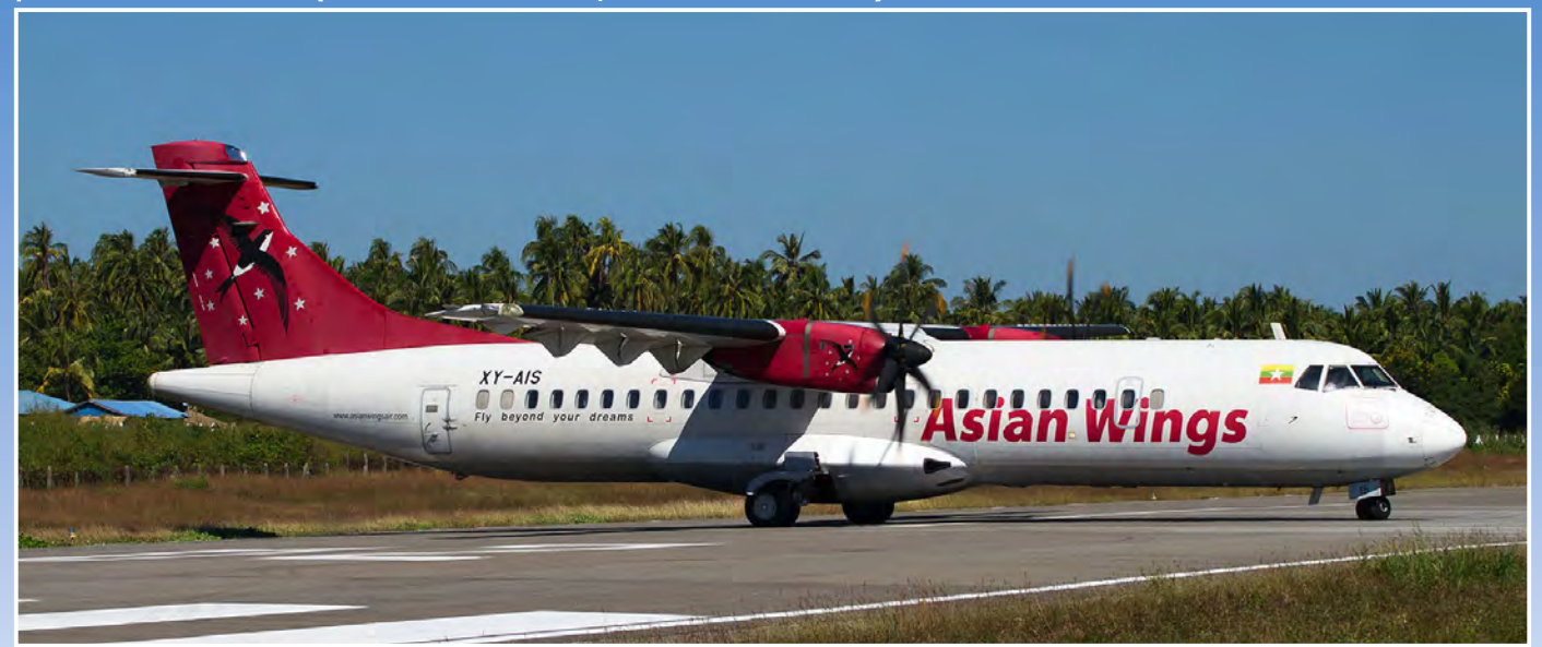
The last ATR72 on this page is XY-AIS of Asian Wings Airways. This ATR flew for Alitalia Express from 1999 until 2010. In October 2010 it was transferred to the Yangon based airline. (Thandwe, 5 December 2016, Peter Heeneman)