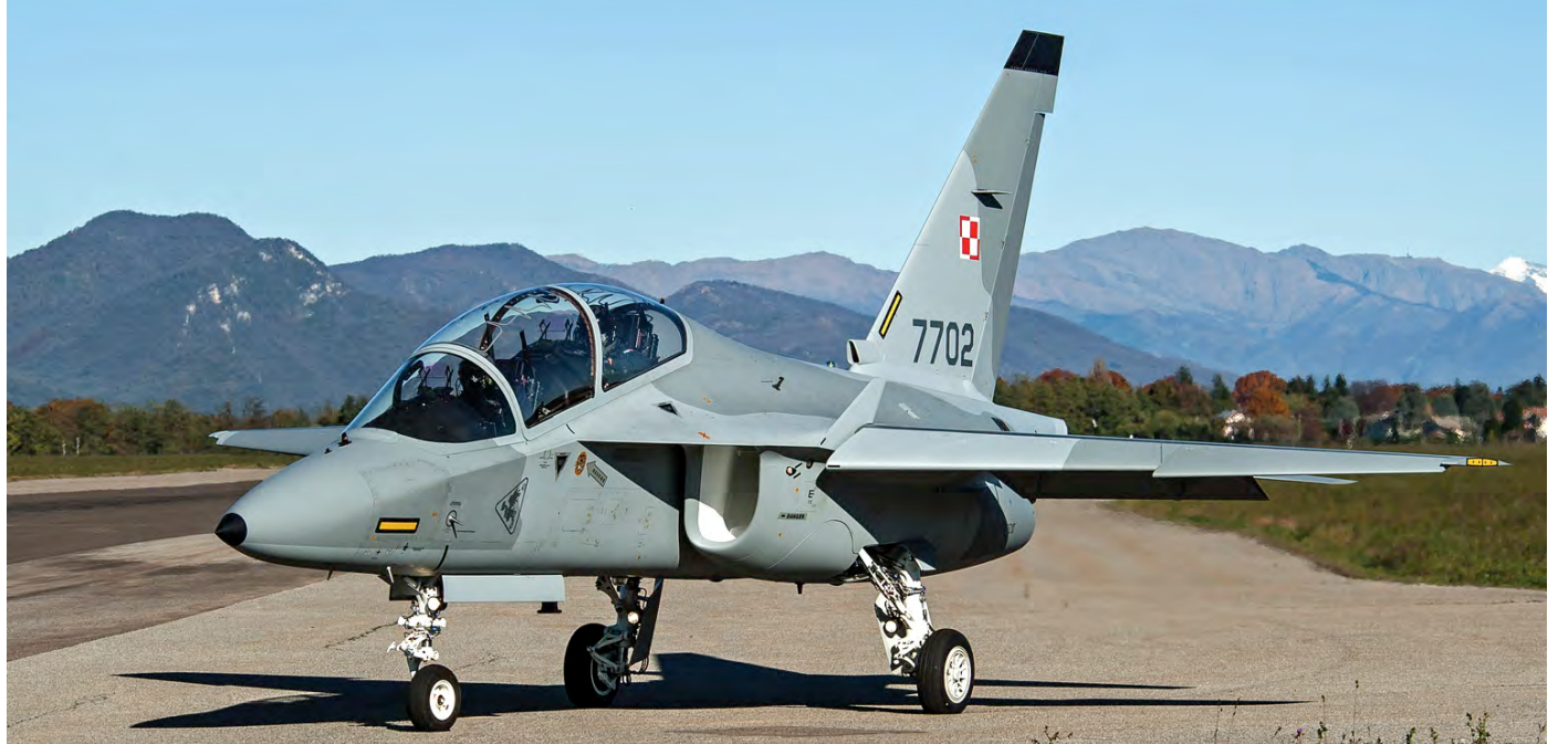
CSX55210/7702 took part in the certification programme in October 2016 and was delivered to Poland on 14 November together with CSX55211/7703 to 4 SLSz - Skrzydlo Lotnictwa Szkolnego, 4 Air Training Wing. The patch on the fuselage is the patch of 41 BLSz - Baza Lotnictwa Szkolnego, 41 Air Training Base. (Varese-Venegono, 12 November 2016, Marco Muntz).

On 29 December 2016 a contract was signed in Belgrade between Airbus Helicopters and the Ministry of Defence and Ministry of Interior for the delivery of H145M helicopters.