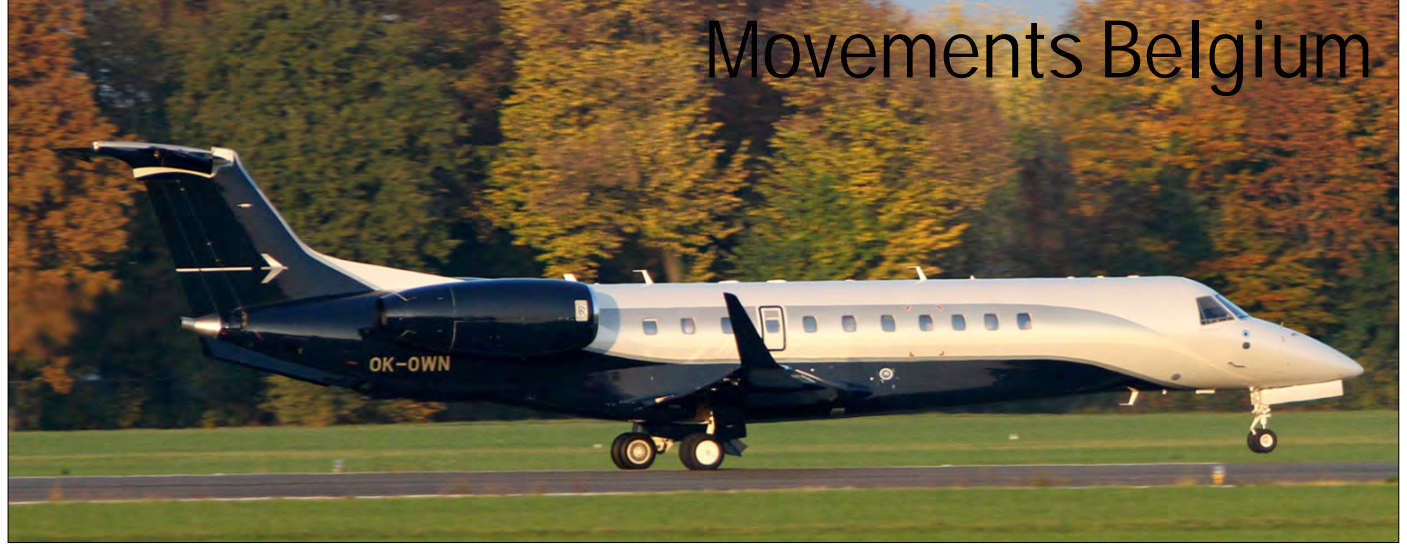
ABS Jets is a business jet operator with bases at Prague and Bratislava Airport. Although established in 2004 Embraer 135BJ OK-OWN was added to its fleet in June 2014. (Antwerp, 11 November 2016,)