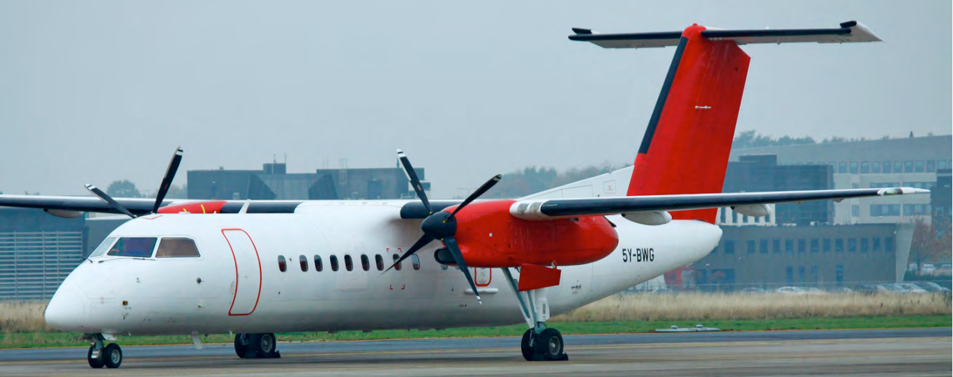
This Dash-8 started its career in China in 1995. It ended up in Africa via Canada in 2008 as 5Y-BWG. Skyward Express added the aircraft to its fleet in November 2016 still registered as 5Y-BWG. (Maastricht-Aachen, 14 November 2016, Bill de Koning)