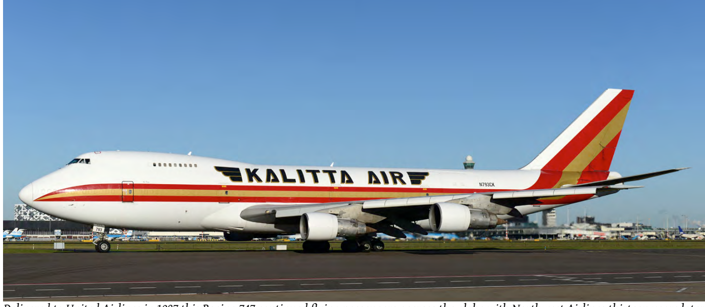
Delivered to United Airlines in 1987 this Boeing 747 continued flying passengers accross the globe with Northwest Airlines thirteen years later. It was converted to freighter in 2001 and continued to operate with Northwest for the next nine years. Kalitta added the aircraft to its fleet in 2010 as N793CK. In March 2017 the aircraft will celebrate its pearl anniversary. (Amsterdam-Schiphol, 28 November 2016, Ton Jochems)