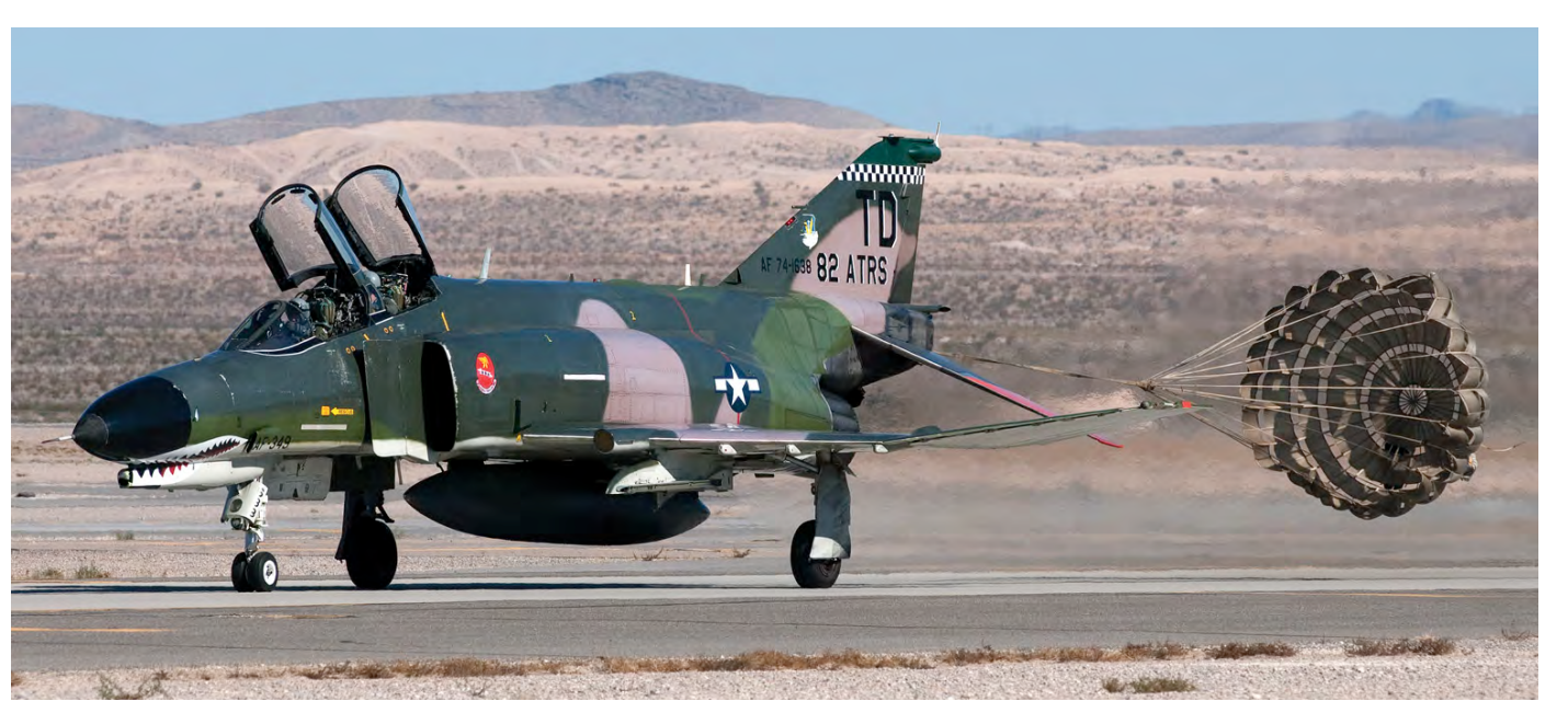
Another photo of QF-4E 74-1638/TD, in a pose we all love: double canopies open, dragchute deployed. Joost de Wit visited Aviation Nation at Nellis AFB (NV) and witnessed what was probably the final public performance of the Phantom in USAF service. (13 November 2016)