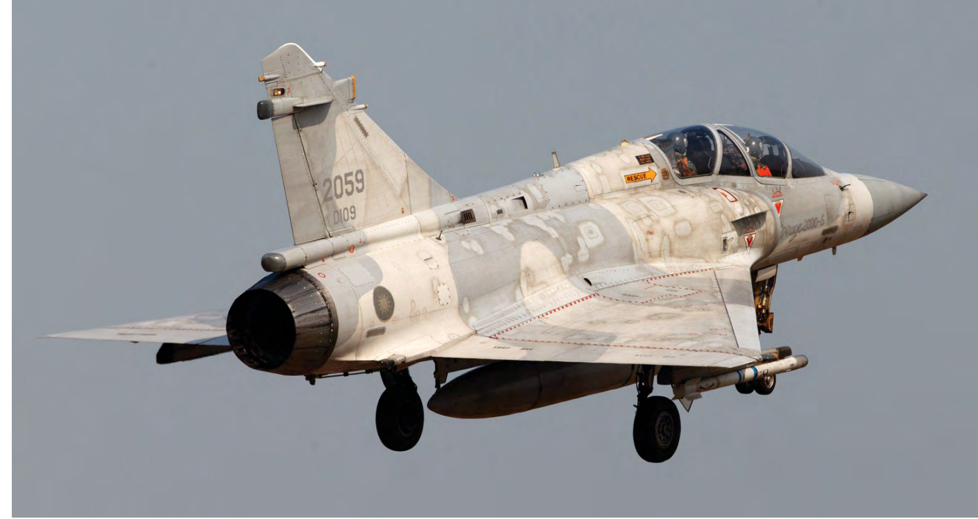
Republic of China Air Force Mirage 2000-5Di 2059 from the 2nd TFW seen here landing at its home base, Hsinchu. (26 November 2016, Marcel J. van Bielder)