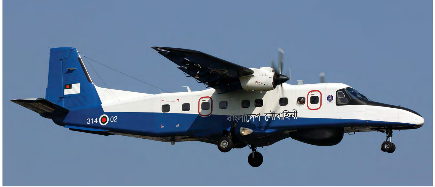
Since 2013 the Bangladesh Navy operates two Dornier Do228-212NG out of Dhaka-International. The latest addition is seen here, 314-02 also on 16 December 2016 by J.Doe.