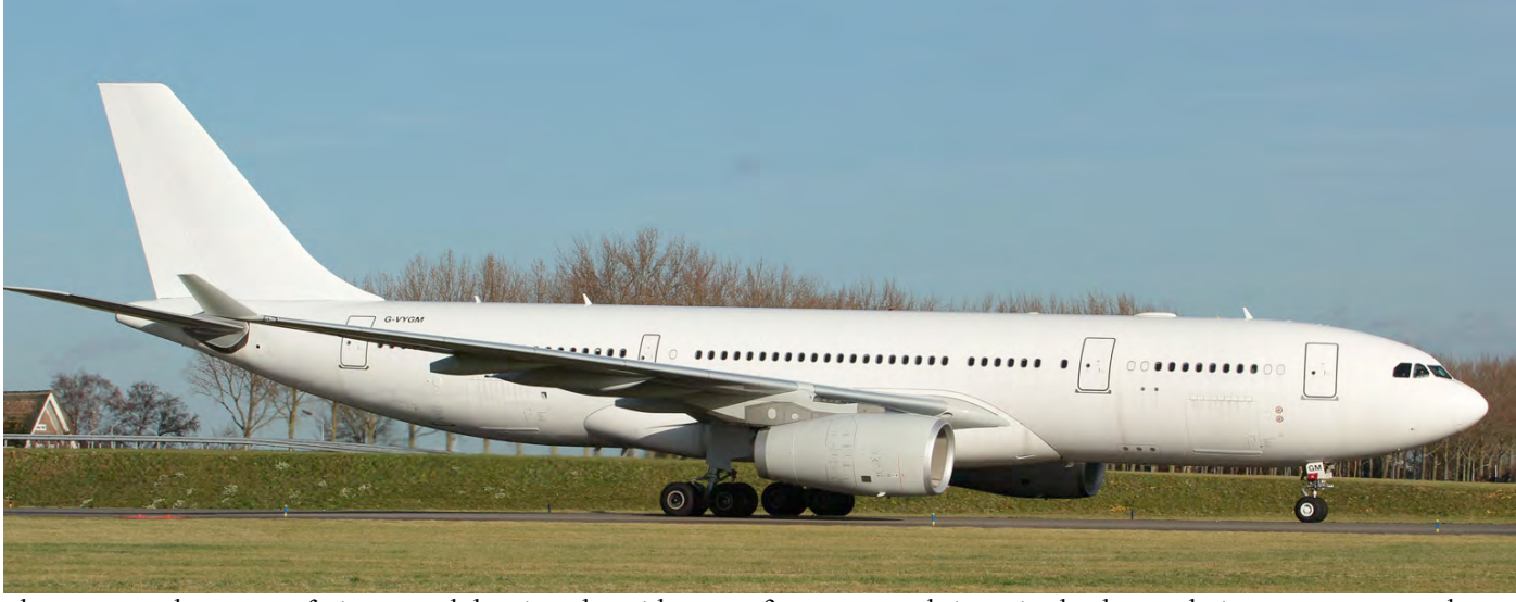
There seems to be some confusion around the AirTanker Airbus A330 fleet. Some are being using by the Royal Air Force as MRTT and some are being used in the civil aviation scene. According to AirTanker these aircraft are demilitarized and do not have any tanker capability while operating for a civil airline. G-VYGM was delivered to the company in February of this year. (Amsterdam-Schiphol, 22 November 2016,)