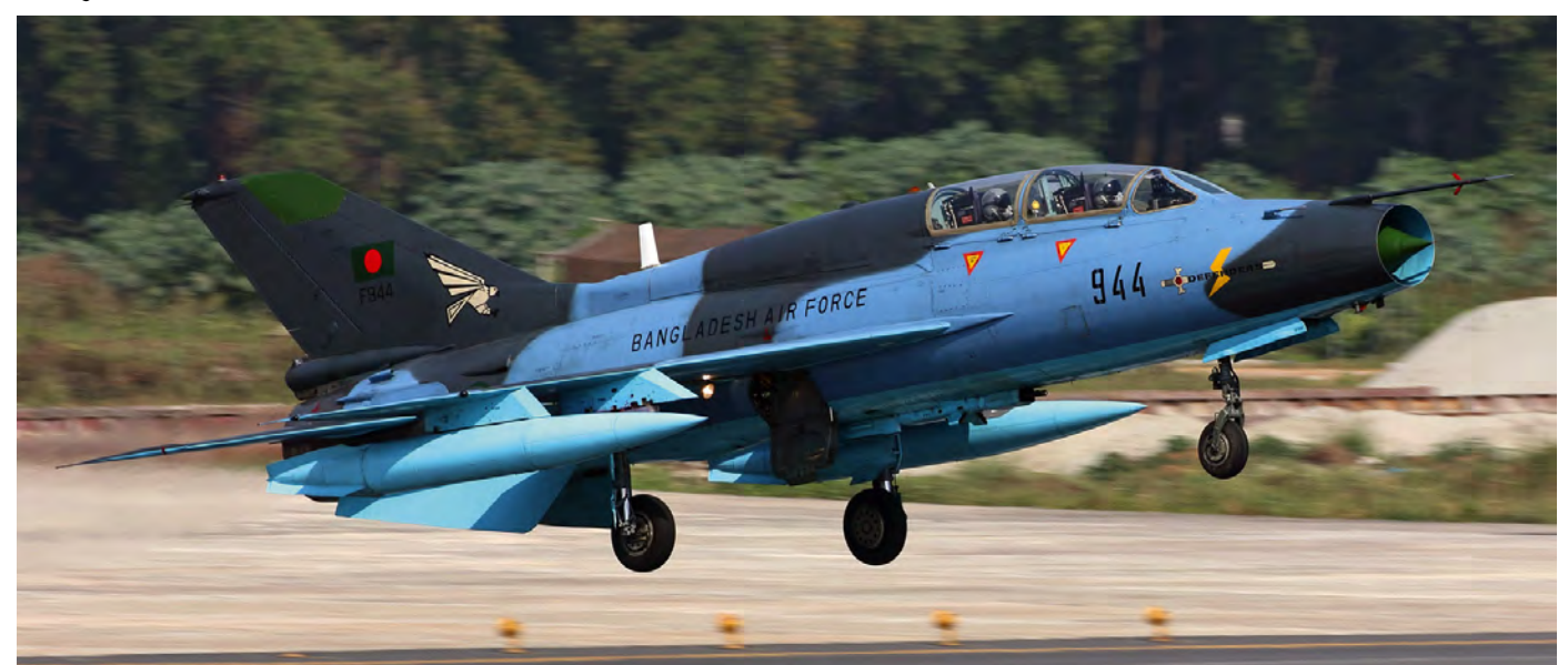
The FT-7BG is one of the last MiG-21 derivatives built. F944 was seen at Dhaka as well. (FT-7BG, 5sq, Dhaka, 16 December 2016) Personal copy Distribution to a third party is not allowed