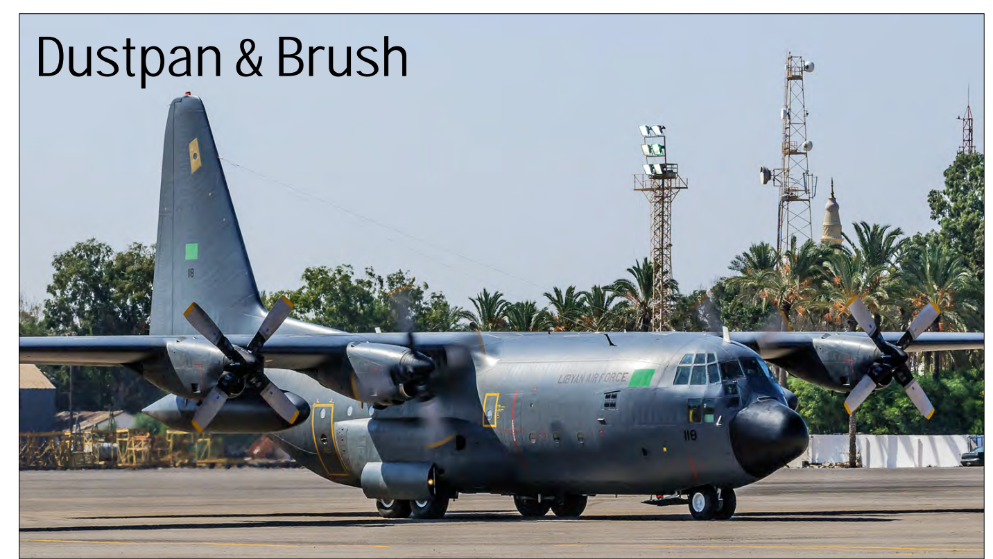
Although this Libyan Air Force Hercules received only light damage on 3 January 2017 at Jufra AB, after it was shot at by a Libyan National Air Force MiG-21, we rarely get pictures from that part of the globe and therefore decided to publish it. Seen here basking in the sunlight on 5 October 2009, Erik Sleutelberg was present at Libyan Aviation Exhibition (LAVEX) 2009 to capture the Herc.