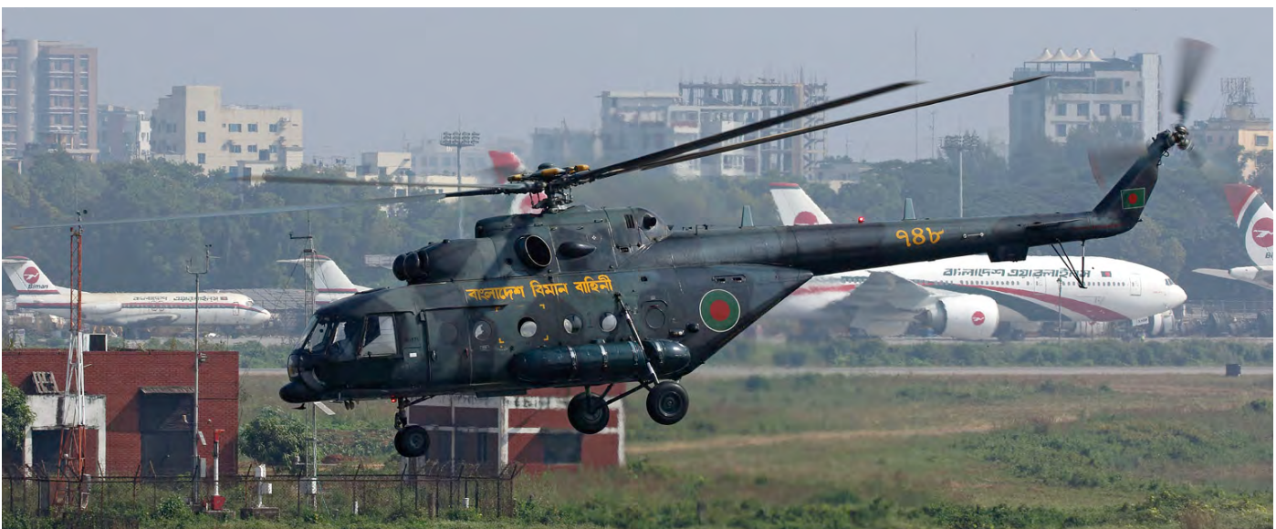
The background reveals a lot about the country of origin, however this photo shows a nice Bangladesh Air Force Mi-171 with registration 748 on the tail. (Dhaka-International, 16 December 2016, J.Doe)