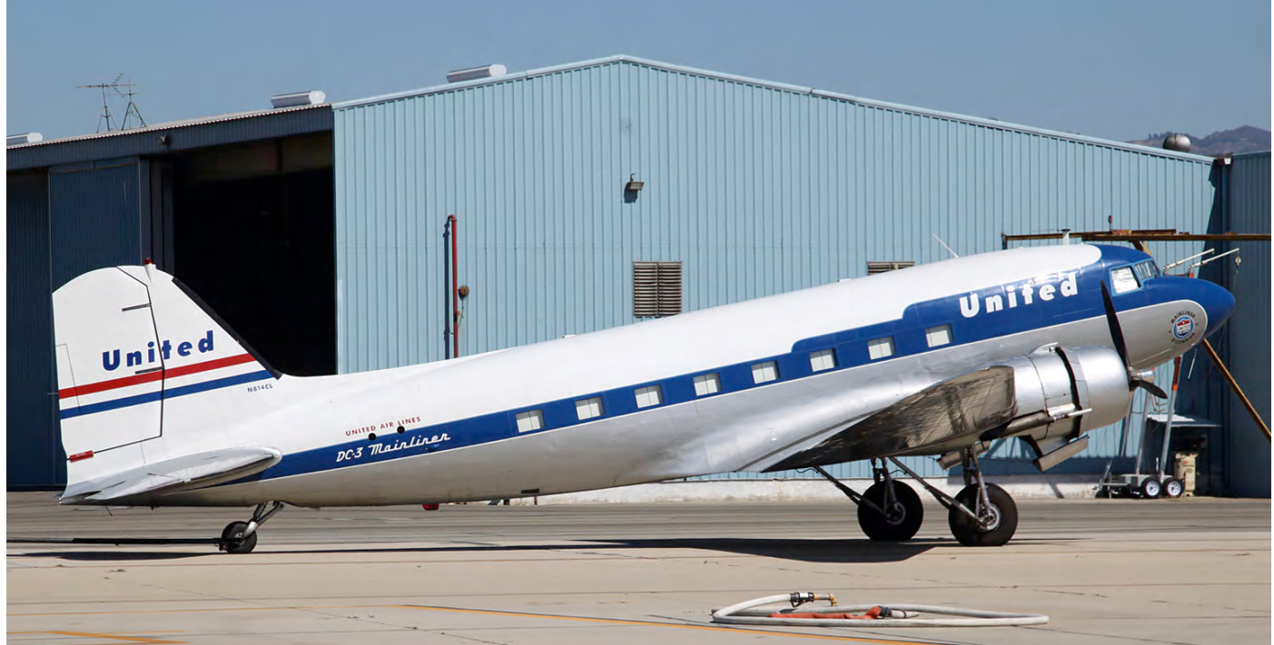
At Van Nuys you can find DC-3C N814CL in a retro United Airlines colour scheme. Ramon Berk photographed it during the pre-arranged visit of the County Fire Service also stationed at this airport on 30 September 2016.

Personal copy Distribution to a third party is not allowed