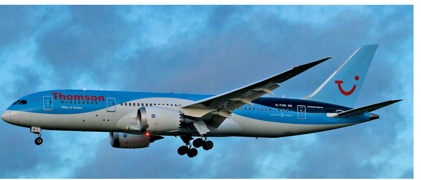
G-TUIE is one of ten Dreamliners currently being operated by Thomson Airways, a TUI brand based in the United Kngdom. The Thomson brand will be phased out by 2018 if all goes as planned and the airline will continue under the TUI brand. (Amsterdam-Schiphol, 22 November 2016,)