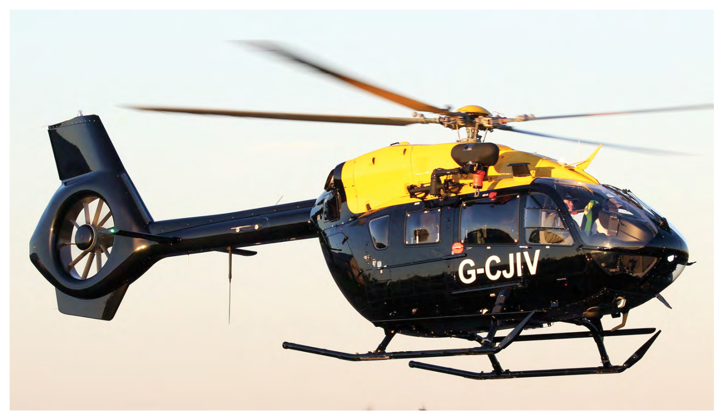
Seen here is H145 Jupiter HT1 G-CJIV during a testflight from Norwich. This helicopter is the first of 32 H135/H145 that will form the new fleet of the UK Military Flying Training System (UKMFTS). (29 November 2016,).

there on 22 December 2016, while ZH885 had already arrived on 29 November 2016. Time will tell if this pair indeed has been sold.