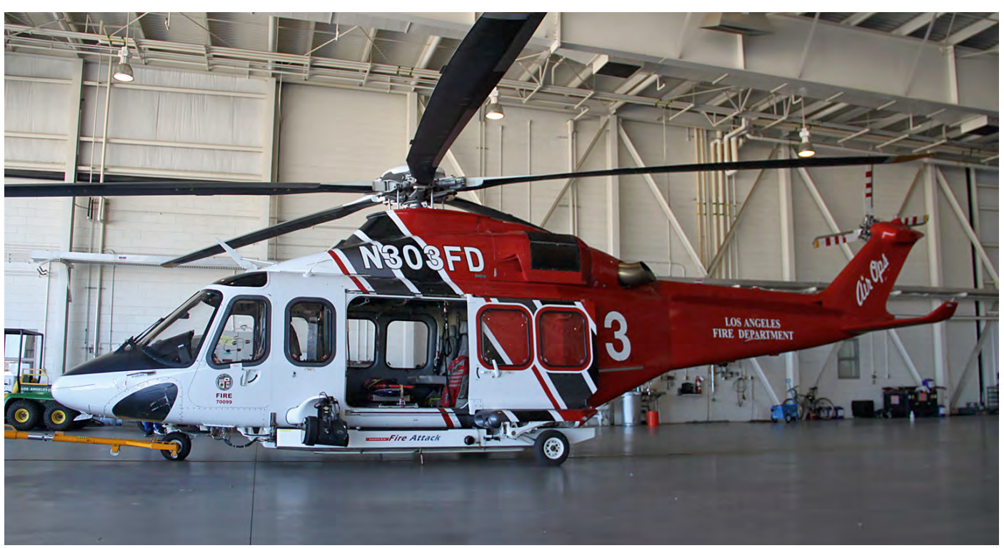
Ramon Berk had an pre-arrange visit to the flying component of the Los Angeles County Fire Department, which operates from Van Nuys Airport. On 30 September 2016, he saw N303FD/3, one of two AW239s seen that day by him.

No surprise i boarded the An-140 for the third time, as throughout the day the An-140 remained on the ramp of Lviv airport.