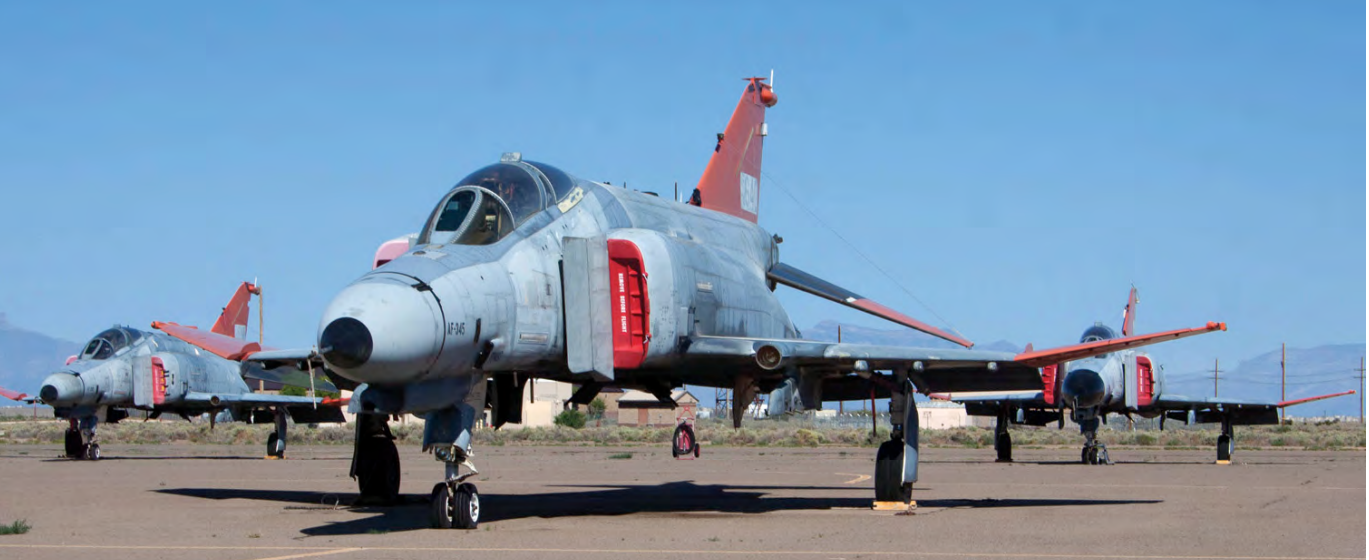
QF-4E 74-1640/AF-345 was seen on 3 June 2016 at Holloman AFB (NM), after being prepared for its final flight on 4 August 2016. During that flight it was shot down by a Florida ANG F-15 over the White Sands Missile Range.